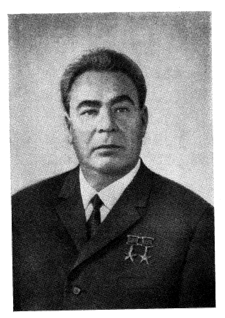
L. I. BREZHNEV General Secretary, CPSU Central Committee