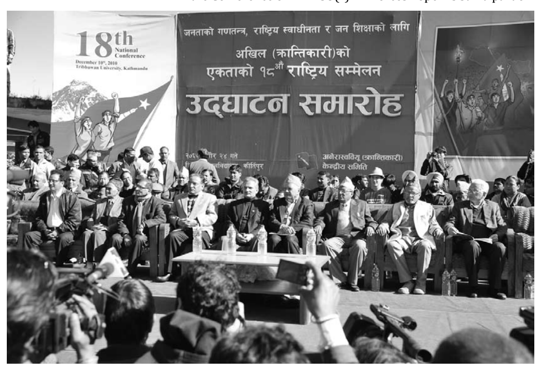
The inauguation ceremony of ANNISUR (Revolutionary)'s 18th national conference

In this 17th December, then, it has been done an important step, a leap in quality in the process of construction of the revolution that the Nepalese Maoists demonstrated to be able to lead, as they say, with science and art. We are pleased to have witnessed it and we will do our best to understand its importance, for make it known by the international communist movement, and to make the masses of our country know that Communism is being reborn in the world like is being reborn here in Nepal.