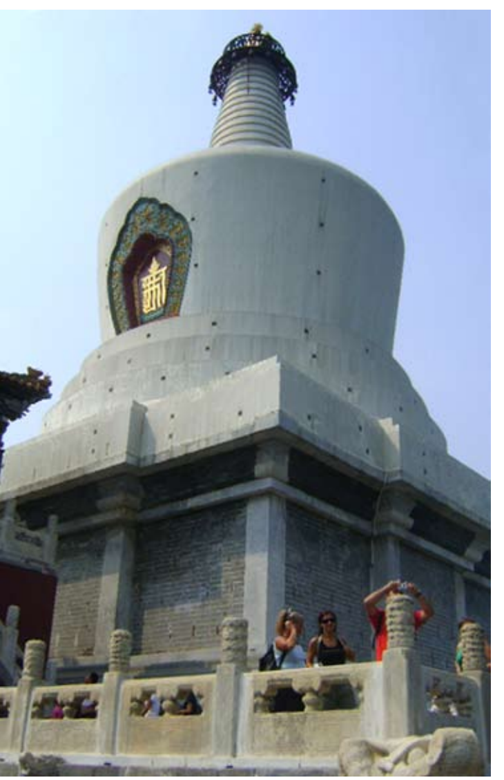
WHITE PAGODA in China stands as a symbol of the friendship between Nepal and China.

Well-planned cities, wide roads, green belts, a well-managed public transportation system, the use of bicycles were significant when we travelled