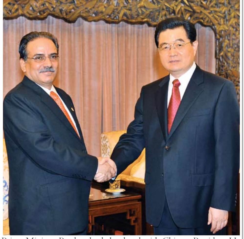
Prime Minister Prachanda shakes hand with Chinese President Hu Jintao during his visit in China.

India should understand the aspirations of the Nepalese people and the minimum civility between