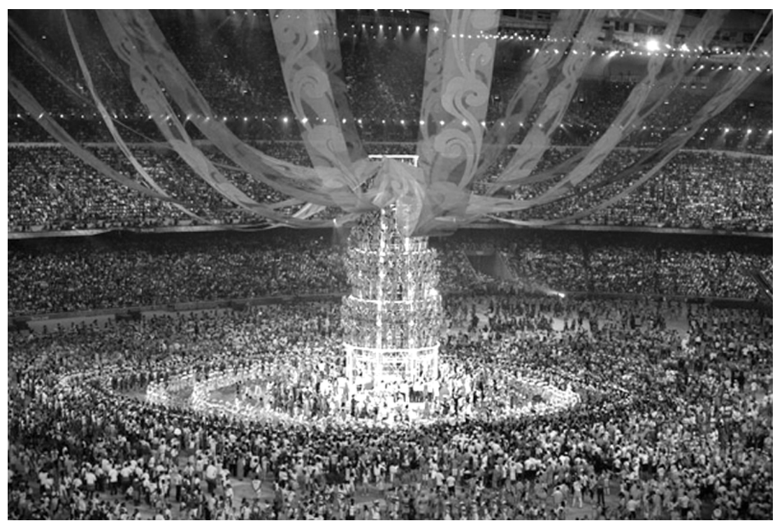
Artists perform during the closing ceremony of 29th Olympic games in Beijing

The next Olympic will be held in London on 2012. Mayor of Beijing Guo Jinlong handed over the Olympic flag to the London's