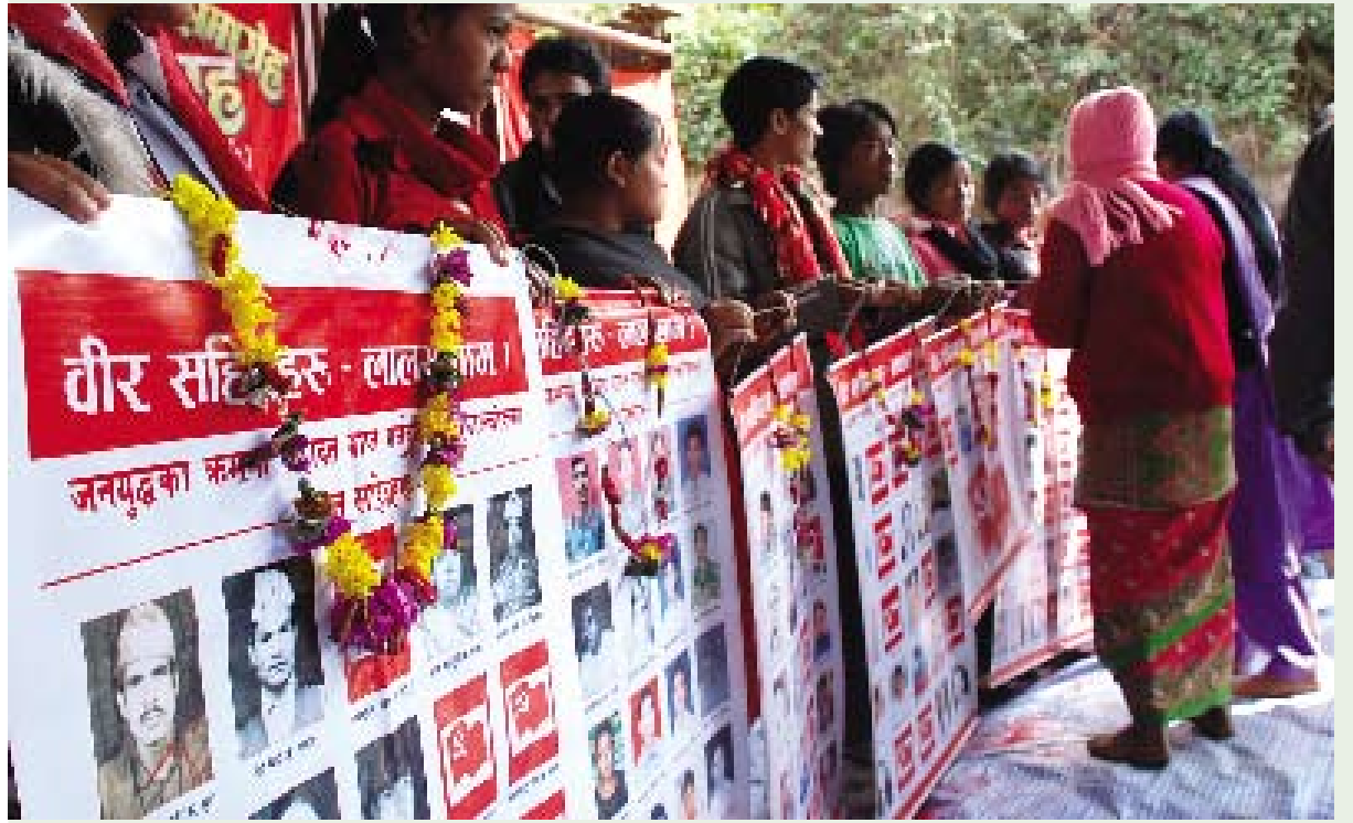
During the course of Nepal's history, brave men and women stepped forward, answering the nation's call to fight against feudalism, foreign intervention and imperialism.