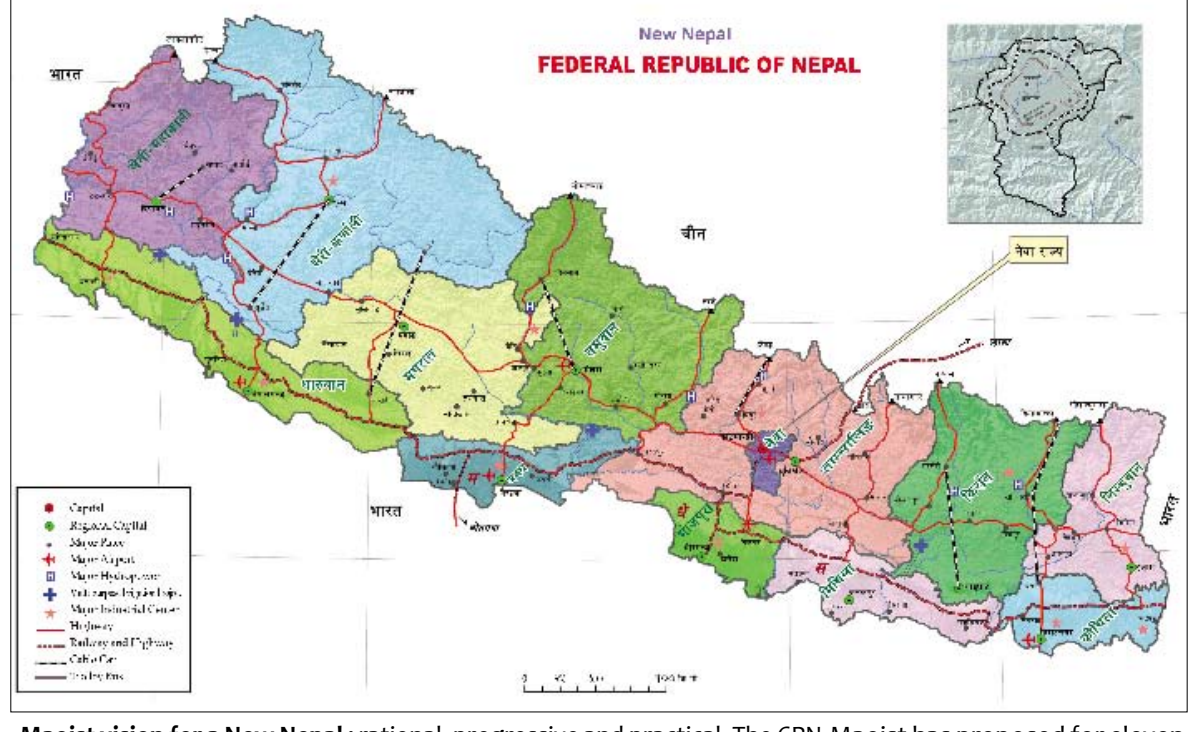
Maoist vision for a New Nepal : rational, progressive and practical. The CPN-Maoist has proposed for eleven autonomous republic state powers and three other sub-states in the federal Republic.

For the objective solution, the CPN-Maoist had proposed an agenda of common candidates before filing the candidacy. But the parliamentary parties were not sympathetic to this proposal. In spite of this last effort at