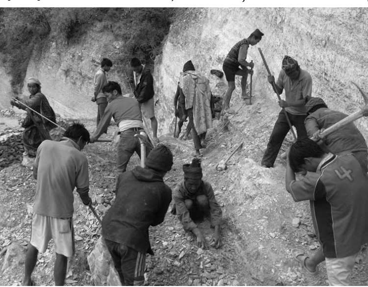
People using pickaxes and shovels to built the Martyr Road

After crossing the border for Nepal, and speaking to ordinary Nepalese, I saw and experienced for myself the truth about Nepal. In Nepal, there are thousands of villages spread all over the Himalayas. The people of the villagers are very poor, and lead very difficult lives in isolation from the outside world and in servitude to feudal lords; it has been this way for centuries. The King is at the head of this feudal order. It is clear what is happening in Nepal; the Nepali masses are rising to put an end to this dreadful feudalism; a feudalism that has subjugated and oppressed them for years. Almost all of the ordinary people, the peasants, farmers, and workers, spoke very highly of the Maoists. Most of these people were not Maoists, they knew very little about Marxism. They support the Maoists because they can see that the Maoists are on the side of the poor and the oppressed. Immaterial of the fact that there is an absolute lack of basic minimum health services or education in the vast rural areas, a person does not become a Maoist because there is no school or heath centre in his village, but rather due to a wide variety of circumstances, from lack of justice in