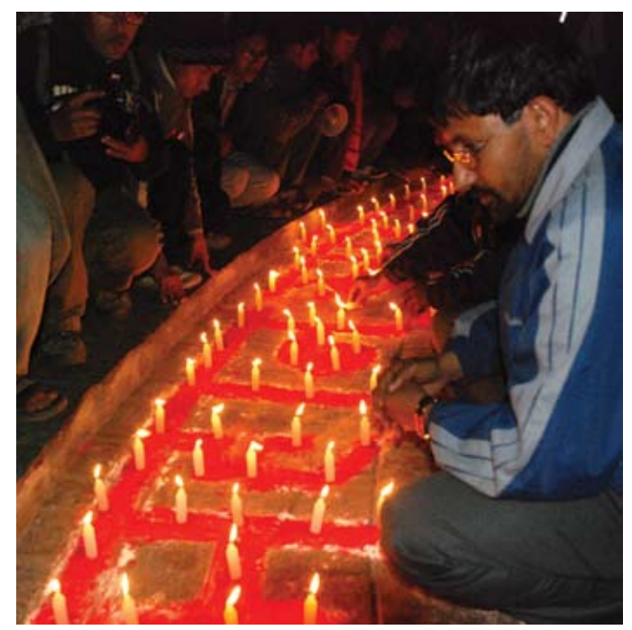
Students paying homage to the Martyr's lighting candles in the Capital

Party leaders, cadres, supporters, well-wishers are celebrating the anniversary jointly. In a program organized