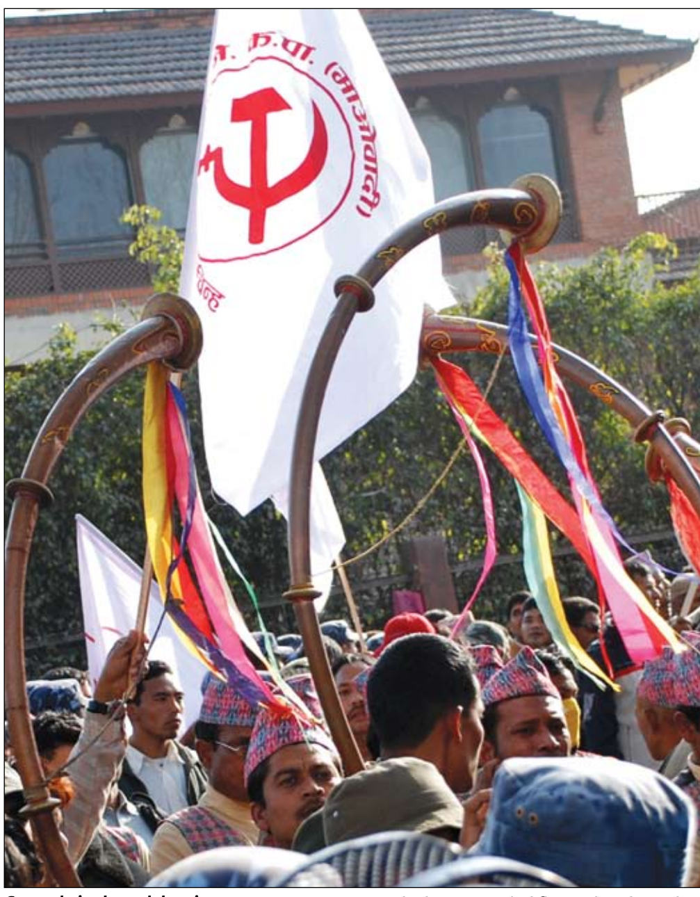
Struggle is also celebration: Maoist supporters with election symbol flag and traditional Nepali musical instrument celebrating while their leaders file nomination in Kathmandu.