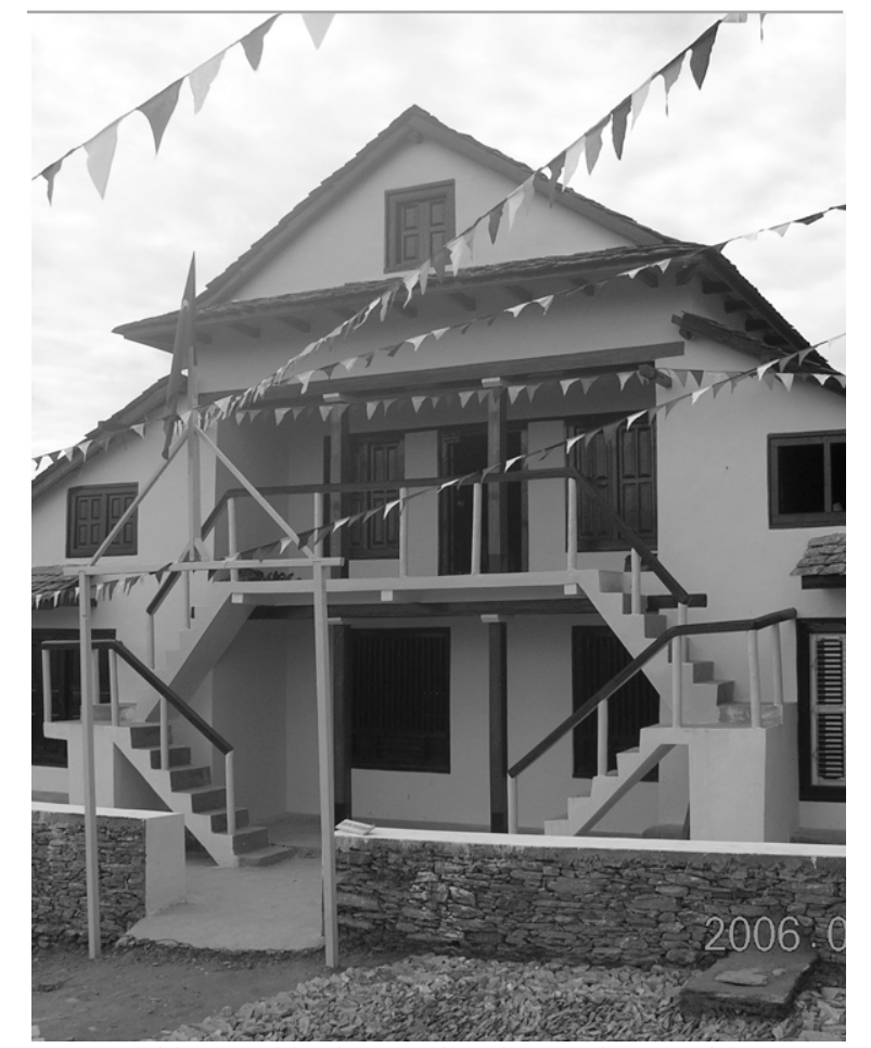
Model hospital built in Rolpa during the People's War

A decade long people's war has been able to recognize the Nepalese soil all over the world. Nepal has been the symbol of shining star of class struggle in the world today. All the justice loving people of the world are looking towards Red Himalayan country, Nepal. The Great people's War has prepared the fertile ground for mass insurrection. Later or sooner, the socialist state power will take birth in Nepali soil in the 21^{st} century.