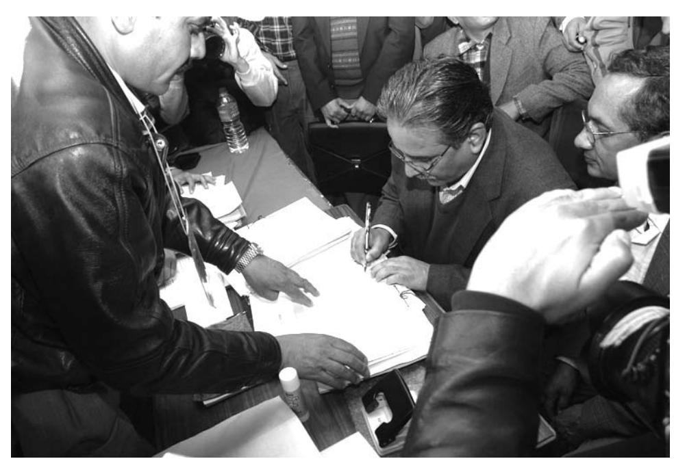
Signing for the battle? CM Prachanda filing the nomination in Kathmandu

Below is the list of Maoist candidates and their respective constituency numbers for the first-past-the-post system. The proportional list is yet to be finalized.