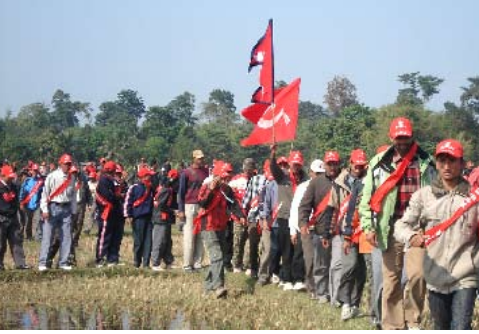
YCL cadres marching in Susta where Indian State has encroached Nepali territory