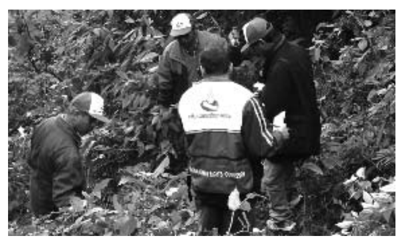
NHRC team investigating the suspicious site at Shivapuri area

Coincidently, soon after the news about the suspicious site revealed, six ruling political parties and CPN-Maoist agreed to