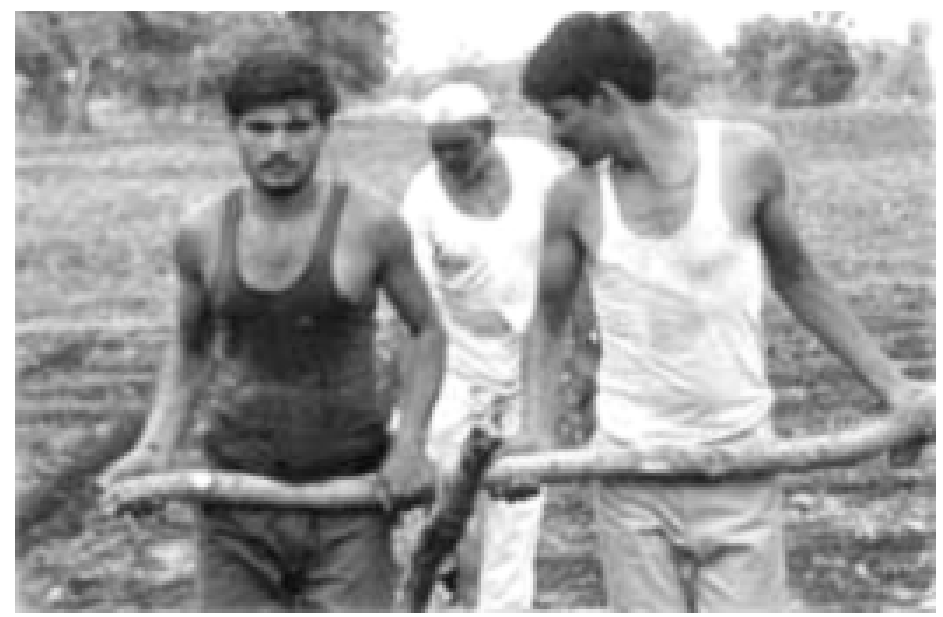
Sons as Bullocks

One in every eight hours!! This means that July 2006 saw an eight-fold increase compared to the same period last year. But, these are the understated official government figures; the actual deaths would be much higher.