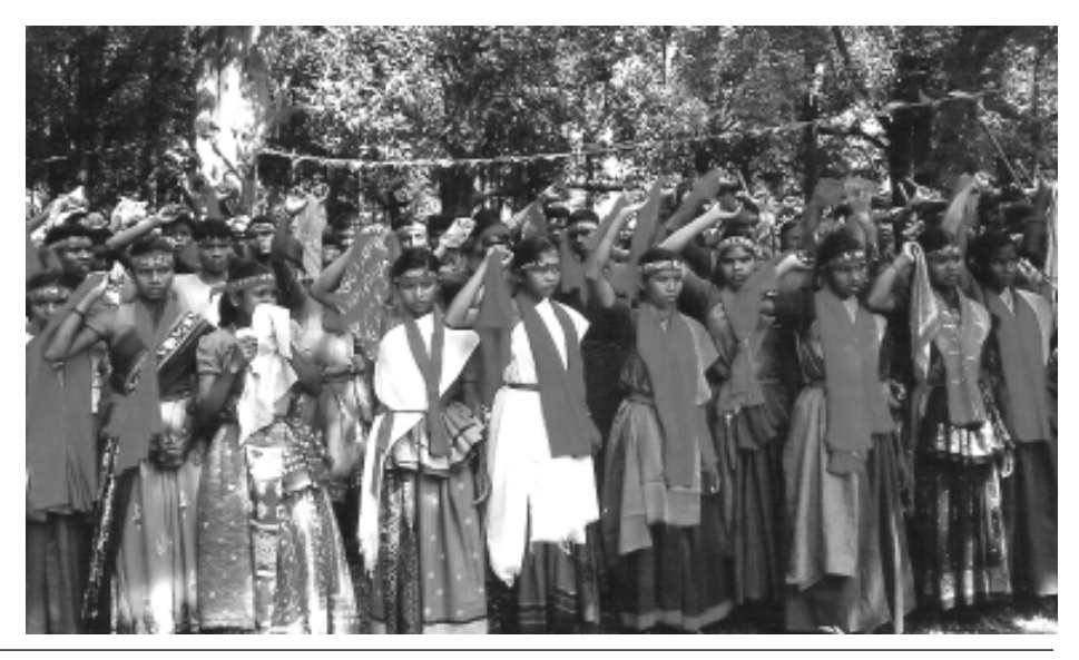
PEOPLE'S MARCH, August-September 2006

PM: What kind of training are you imparting to the young men and women and to children in the villages?