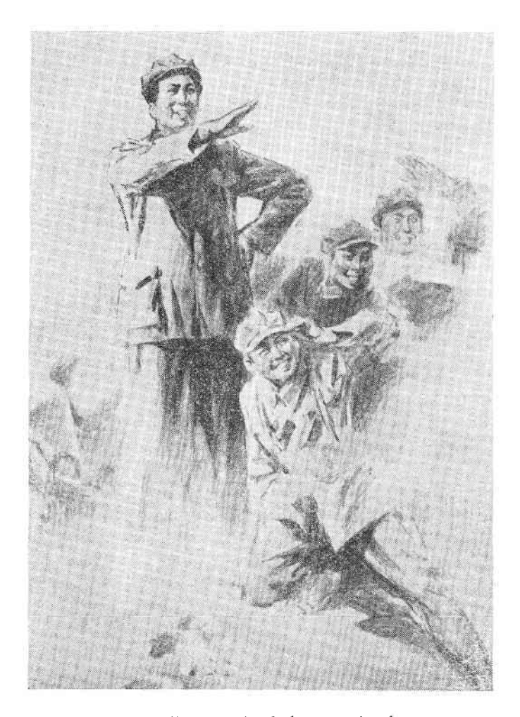
Finally we gained the summit of the mountain pass. (p.69)

Not long afterwards, we met comrades of the Fourth Front Army carrying banners with the words: "Expand the revolutionary base in northwestern Szechuan!" We-