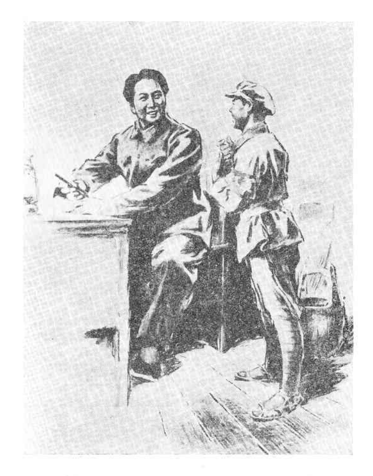
"What do you want to tell your father?" (p.13)

"No," I smiled. "I wouldn't go even if you ordered me!"