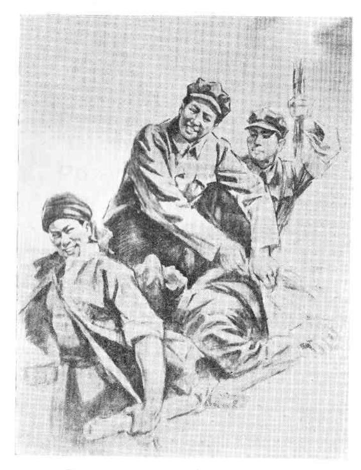
"Is your wound very bad, comrade?" (p.25)

At dawn, crowds of people appeared on the road, surging back and forth. On the walls, on the trees and everywhere in the villages posters announced the news of our victory: "Our troops have captured Kupi and Hsintien!" and "Celebrate our first great victory!"