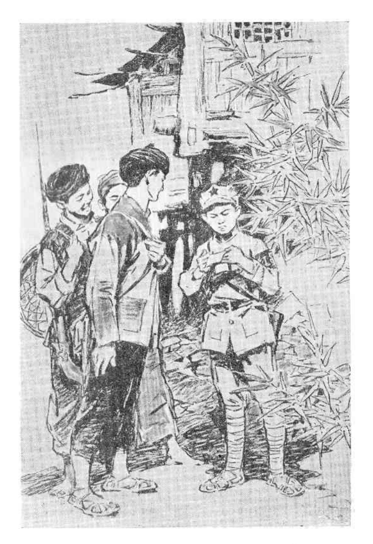
"Yes, yes," a big fellow pulled a small piece of paper out of his pocket. (p.34)

"Yes, yes," a big fellow pulled a small piece of paper out of his pocket.