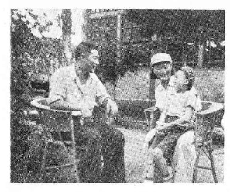
My husband and child,

In the university, I met over two thousand comrades from various factories and administrative posts of whom one thousand five hundred were labouring people of worker or peasant origin. The university is training these politically firm workers, peasants and intellectuals, who have had practical experiences in revolutionary struggle, to be cadres in the various fields of construction of New China. I began by attending the textile class in the Department of Factory Management, but because my cultural level was low, I had to join the preparatory class. I had trouble even with the courses in the preparatory class. I had never been to school. During more than ten years or so that I had been schooled in revolutionary work, I had learned to read a bit, but I wasn't much good at writing. I could understand everything that the professor said in the course on politics but I couldn't take down what he said, so the only thing was to copy the notes of my classmates. . . . Every free moment and even during the time when we were supposed to sleep, I was patiently copying notes, word for word. I encountered more difficulties in the