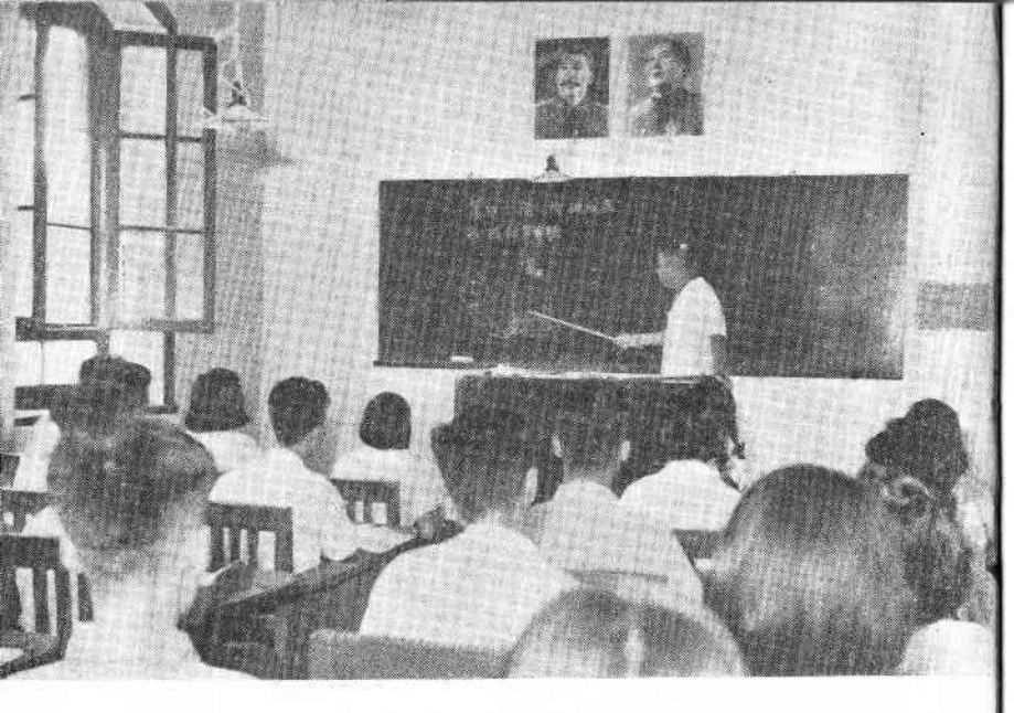
In the physics class.