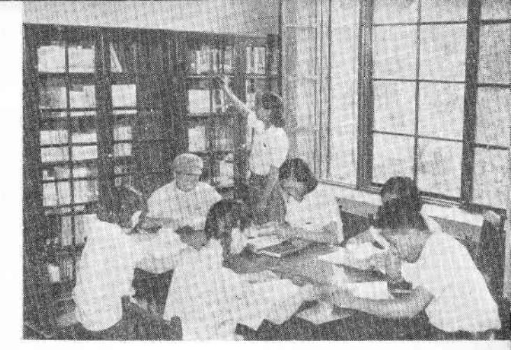
A corner of the reading room often visited by our group.

Students of our group reading the daily paper in spare time.