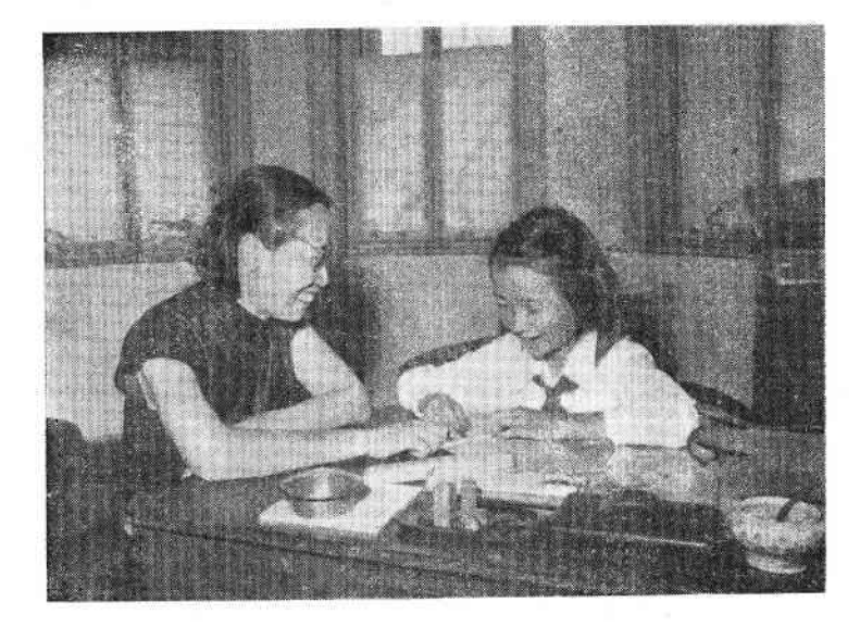
For the first time, we enjoy life.

Today, the People's Government share the duty of us mothers in bringing up our children. They have created a proper environment for children to learn in and opened up the road to happiness. Children who