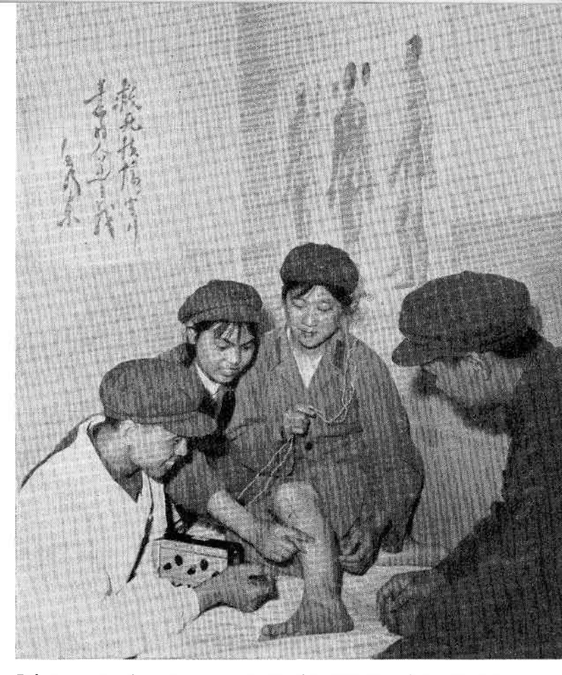
Before an operation surgeons at the People's Liberation Army General Hospital try the needles on their own bodies in order to find the best points and perfect their skill. Acupuncture anaesthesia is used extensively at the hospital.

Acupuncture anaesthesia used in the removal of a cerebral tumour at the Tungfanghung Hospital, Peking.