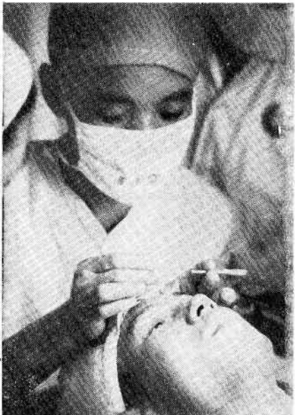
Needling the nose for a herniotomy.