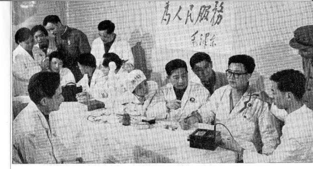
Scientists of the Physiological Research Institute of the East China Branch of the Chinese Academy of Sciences and medical workers of the Shanghai No. 1 People's Hospital experiment with needling on their own bodies to test the degree of pain, find new points for effective needling and new methods of stimulation. Their aim is to improve acupuncture anaesthesia and enlarge its scope.

Acupuncture anaesthesia being used in the removal of the greater part of a patient's stomach at Peking Medical College's Third Teaching Hospital where remarkable successes in acupuncture anaesthesia research have been made.