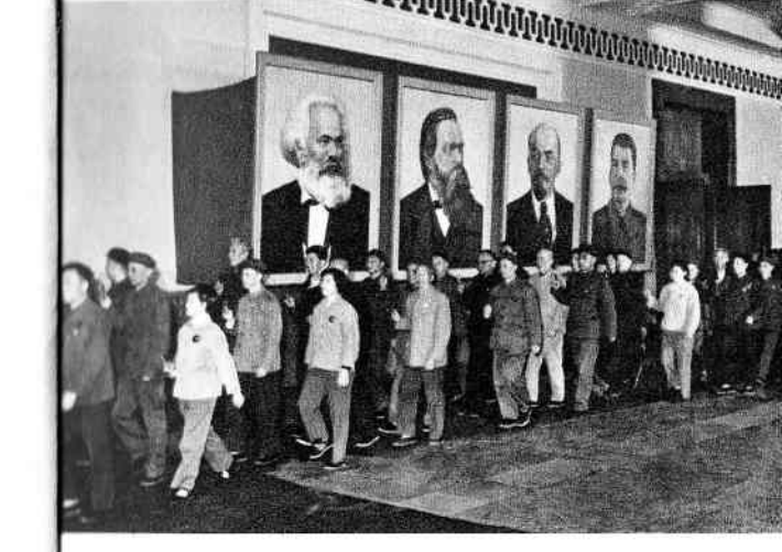
Delegates from various fighting posts march into the meeting hall full of revolutionary spirit.

Printed in the People's Republic of China