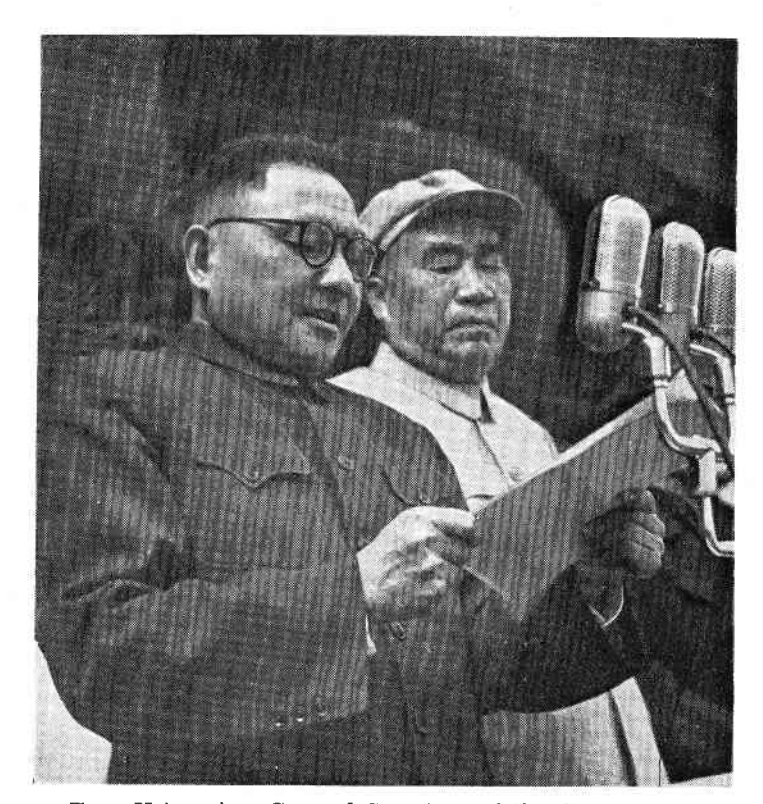
Teng Hsiao-ping, General Secretary of the Central Committee of the Chinese Communist Party, addressing the mass rally of the people of all walks of life held in Peking in support of the just stand of the Soviet Union and against U.S. imperialism's wrecking of the four-power conference of government heads