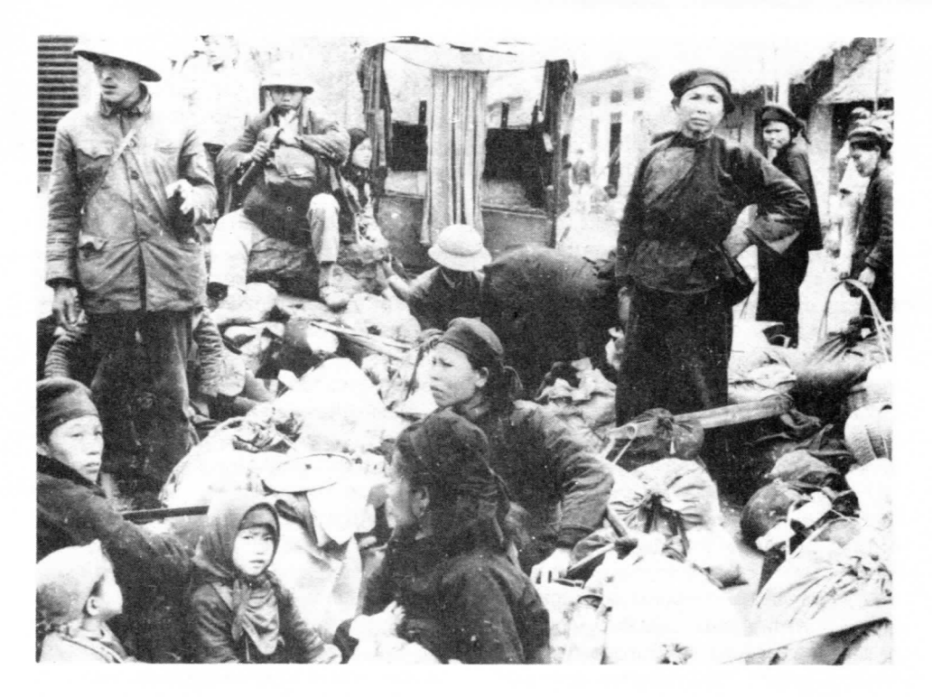
As a result of Chinese aggression, thousands of people in the border areas lost their homes.

On February 17th, China invaded Vietnam expecting an easy victory so that it could impose harsh penalties on a defeated Vietnam, putting more difficulties in the way of reconstruction. At first 200,000 troops along with tanks, powerful artillery and armoured cars were thought sufficient, but were hastily increased to 600,000 and even more