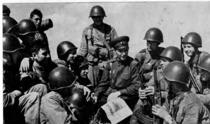
Political education classes. Servicemen study Marxist-Leninist theory.