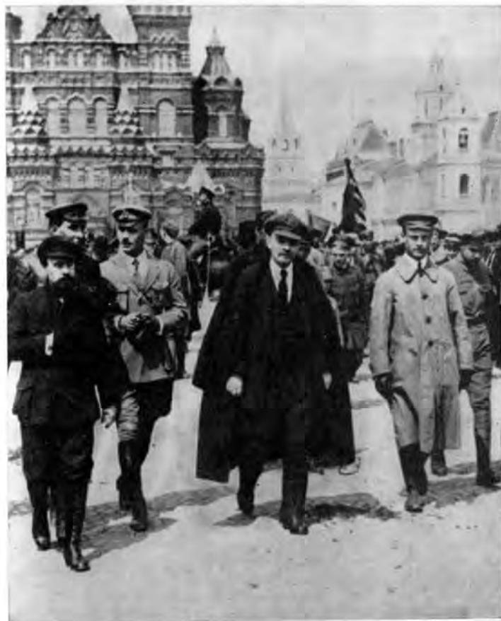
Lenin, reviewing a military parade in Moscow's Red Square in 1919.

In the first, defensive stage of the battle of Stalin-