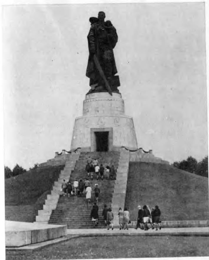
The monument to the Soviet soldier-liberator in Treptow park in Berlin, the capital of the GDR.