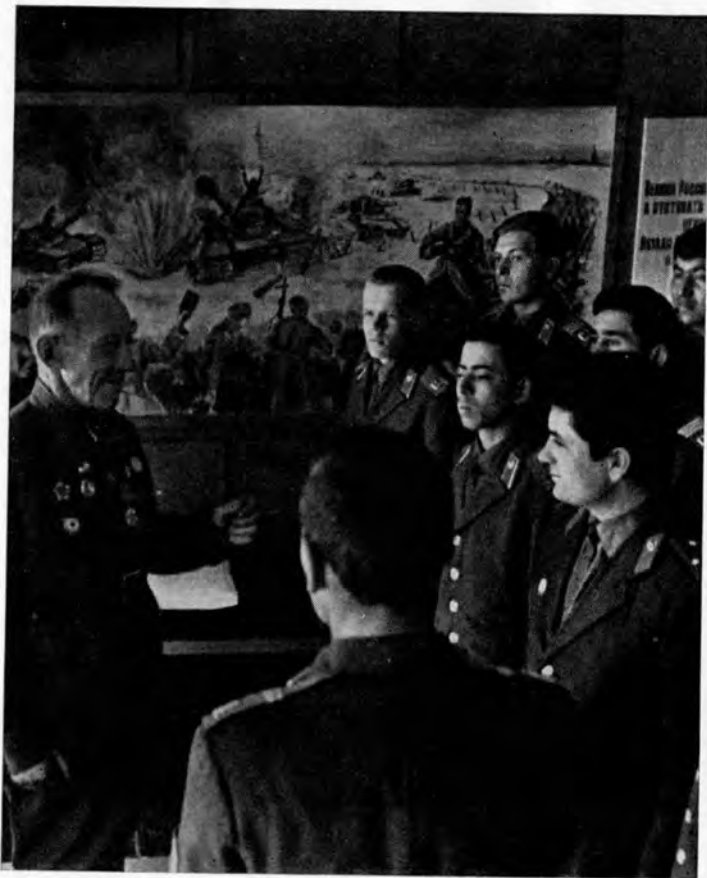
Listening to a war veteran.