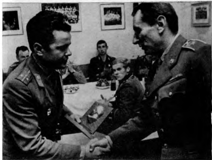
A friendly meeting of servicemen of the Warsaw Treaty member-states.