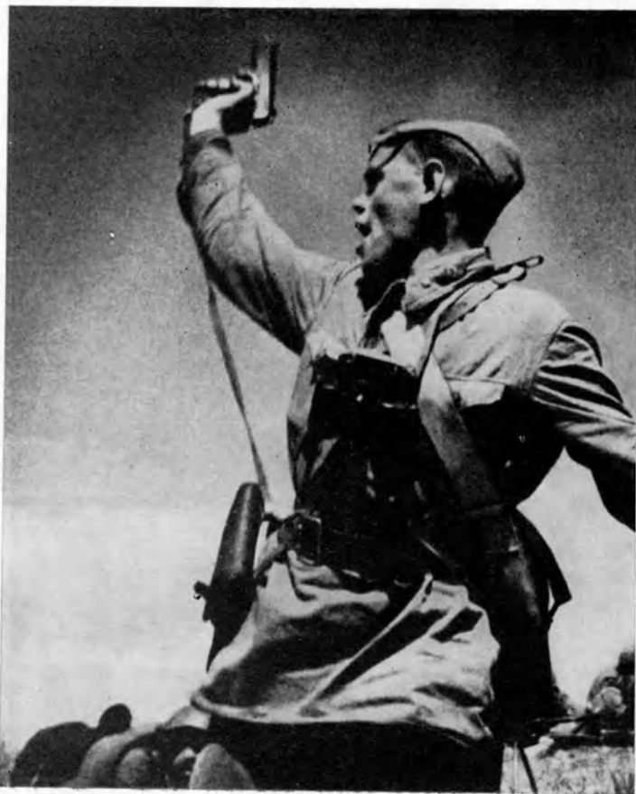
The Soviet troops courageously defended their Homeland against Nazi invaders.