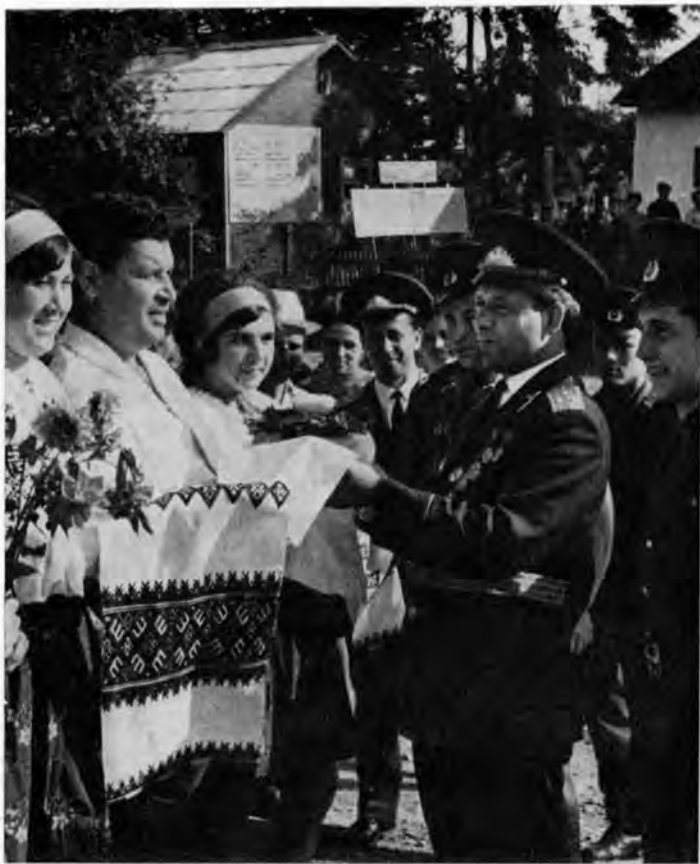
The people and the Army are one.

grad, which lasted from July to November, 1942, the Nazis lost a total of 700,000 men, more than 1,000 tanks, over 2,000 guns and mortars, and 1,400 planes.