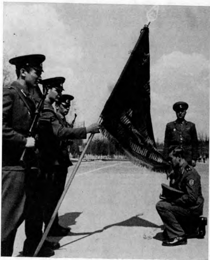
Farewell to the Flag before transfer to the reserve.