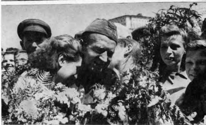
People cheer Soviet soldiers, their liberators from Nazi bondage.