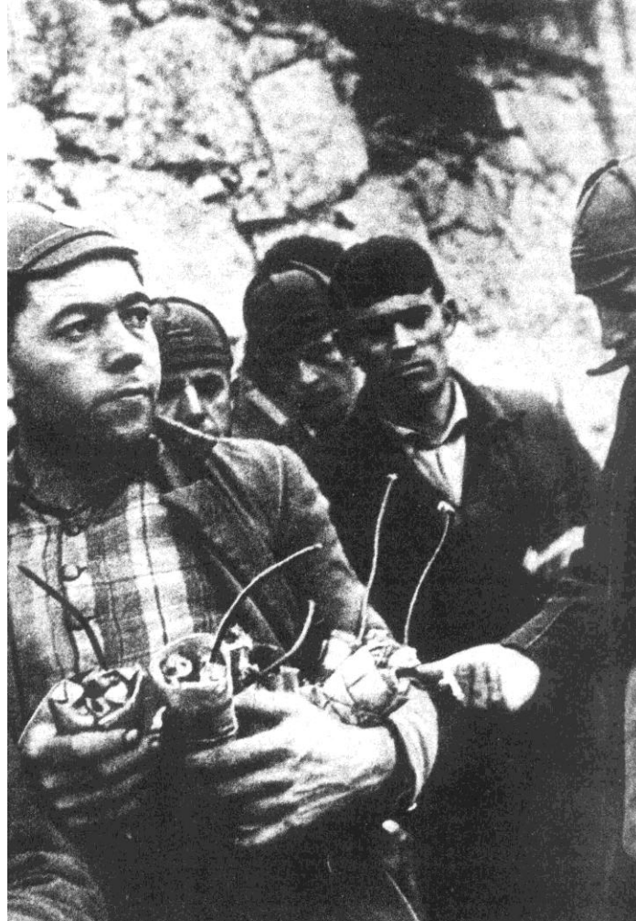
"Dinamiteros"--miners from Asturias, armed with the tools of their trade, who early in the war came to defend Madrid against Franco's tanks

stratum workers and, even more than earlier, the petty bourgeoisie, but these groups had been crushed down by the terrible crisis of 1933 and disillusioned by the brutal repressive policies of the Second Republic. In short, the Socialists and their base had been radicalized. They were willing to take the most extreme measures—but still with the aim, as we have seen, of Republicanism, bourgeois democracy.