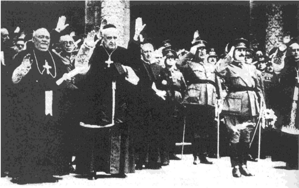
Bishops and Franco's generals indulge in an orgy of mutual saluting and blessing. The Spanish army and the Church--each with an enormous bloated bureaucracy--were two of the main pillars of the Spanish ruling class.

The generals had counted on swift, violent action, using a minimum of forces. Leaders of the mass organizations sometimes hesitated—they were fooled by reactionary government officials promising “the support of the authorities,” or were intimidated by a show of force, or simply tailed after the Republican officials when they vacillated ... but where the masses had a healthy disrespect for “bourgeois legality” they took action immediately, and smashed the military in their barracks.