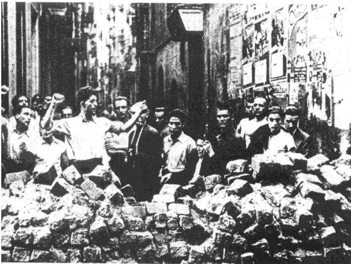
Barricades in the streets of Barcelona, July 1936. "... where the masses were in the streets in great numbers and took the offensive, the fascist troops soon found themselves cut off and paralyzed."

The Spanish bourgeoisie had never been strong enough to carry through a bourgeois-democratic revolution and free the country's industrial development from feudal fetters, as had happened elsewhere in Europe. Far more importantly, in terms of its development, it was too weak to compete successfully with the imperialist great powers, not only within Spain itself, but also in the export of capital and the division of the world. Spain had been stripped of its most important, most profitable colonies by the U.S. in the 1898 Spanish-American War. Even in those colonies it continued to hold on to, the lion's share of the benefits of imperialism were reaped by Spain's "protectors," especially Britain, who both really did "protect" Spain (in the sense of keeping other imperialists out of Spain's remaining empire), but in true gangster-style forced Spain to pay dearly for that protection.