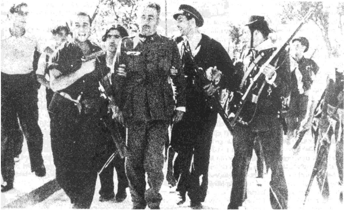
Civilians and militiamen (organized by political parties and unions) escort a captured fascist officer to immediate trial.

Meanwhile, the Junta of Defense which the government had so formidably named, existed only in Caballero's mind. Miaja's calls to government offices, including those in charge of military stocks and personnel, mostly went unanswered; others greeted Miaja with a laugh and hung up. Miaja was becoming desperate; he knew he had but ten rounds of ammunition for each of the ten thousand rifles left in the city.