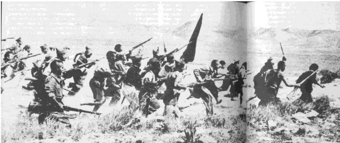
Forces of the Republic rout fascist troops on the Saragossa front in 1936

[This is an unsigned article that appeared in Revolution magazine, vol. 6, #1, June 1981, pp. 32-70, published by the Revolutionary Communist Party, USA. It has not, so far as we know, been made available on the Internet by the RCP. A few of the photos accompanying the article have been omitted here. —BannedThought.net]