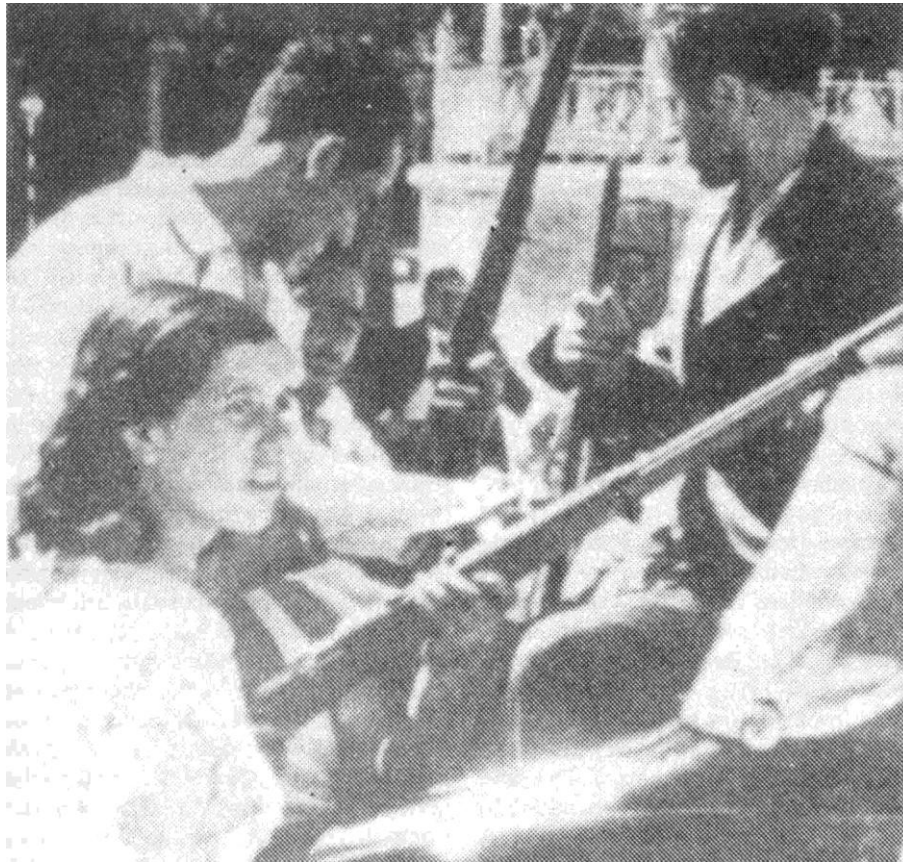
Madrid, July 1936. Caches of arms are broken open and weapons distributed. A key part of the planned fascist coup was to be an attack on the city by troops of the great Montaña barracks. But the barracks were surrounded and the soldiers pinned down.

bourgeoisie's international “reserves”—its ability, and necessity, to reach abroad to other powers to aid in propping up its rule.