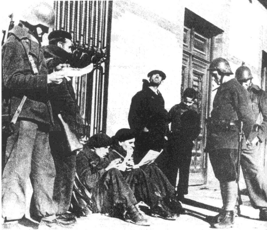
Anti-Nazi Germans of the International Brigades take a break in the streets of Madrid before returning to battle.

inter-imperialist world war. While the largest number of recruits came from nearby European countries, volunteers also arrived from South America, Central America, China, Japan and Morocco.