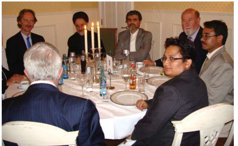
Minister Bhusal interacts with different participants of the forum including ex-president of Iran Mohammad Khatami.

The Norwegians argue that their petroleum will finish in about 100 yrs; but the sea will remain forever. Fishing will help the Norwegians keep their standard of life. We can draw lessons