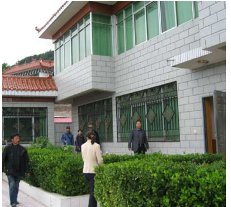
After the community set-up, within 10 years time Nima built his own house.

learnt about a community set-up in a town where 52 families (of 206 people) had constructed a commune. Their lives drastically changed after the commune was set up. We visited the commune and saw nearly every house: Every family had