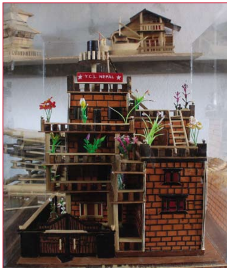
The Young Communist League (YCL), a sister organization of CPN (Maoist), has been a matter of discussion from the date of its re-activation. The YCL has carried out various types of activities such as tackling corruption and crime, managing traffic, managing garbage in Various cities, supervising drug addicts etc. But after the election of Constituent Assembly, it has changed its activities. The League is now focused on collective farming with modern techniques, handicrafts and handloom production etc. The above picture is one of the handicrafts produced by the YCL cadres of Kapan, Kathmandu.