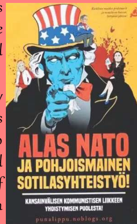
A Finnish poster

Demanding definite wages, thousands of workers, mainly industrial workers took to the streets of Port-au-Prince with posters and banners in Haiti. The demands were a minimum wage of Rs. 100 a day, nine hour working day. In Argentina hundreds of people held a demonstration demanding the withdrawal of the new agreement of the government with the IMF. Programs were held in Spain with ten thousand people in Madrid. Health workers and those from other sectors held protest demonstrations in Venezuela.