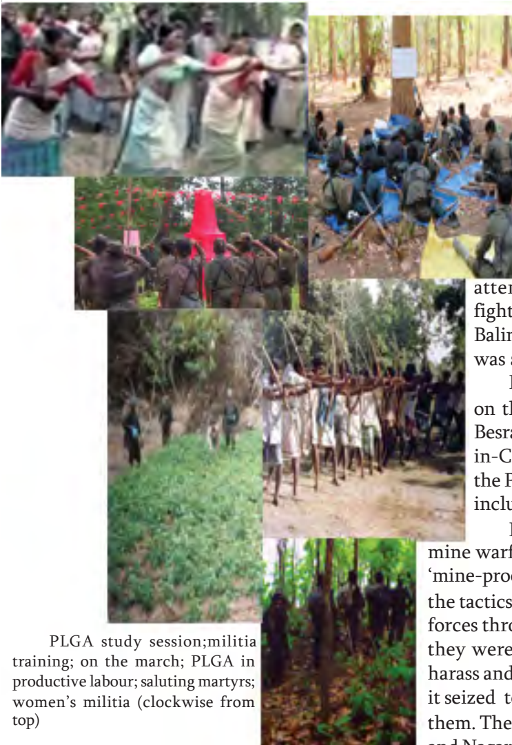
PLGA study session; militia training; on the march; PLGA in productive labour; saluting martyrs; women's militia (clockwise from top)

building the magic weapons of revolution building the magic weapons of revolution building the magic weapons of revolution building the magic weapons of revolution building the magic weapons of revolution building the magic weapons of revolution