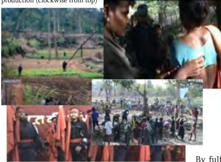
PLGA medical team; joining collective labour; cultural team; in production (clockwise from top)

The people's army plays an important role in organising the party in the vast countryside. By carrying out the various tasks such as mobilising, organising, fighting, propagating and participating in production, the people's army arouses the masses into struggles on their basic and partial demands, makes them active participants in the armed struggle, and raises their political class consciousness to a great extent. It thus lays the basis for extensive building of the party network among the basic classes.