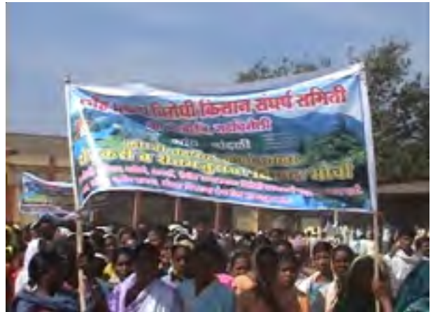
anti-displacement rally at Korchi, Gadchiroli

With the seizure of political power, 'Land to the Tiller' was a clarion call of the armed Agrarian revolution inaugurated by Naxalbari in 1967. In the countryside where the vast majority of India's people reside, the large majority of the toilers do not possess the means of production most crucial for a predominantly agrarian society — land.