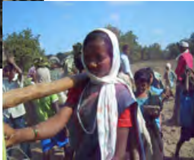
Harvesting a co-op farm