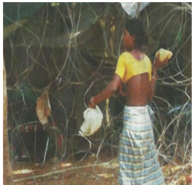
Pelting stones at the Edsimetta CRPF camp

Timmapuram are living in utter dire condition. They have received no relief from the state. They said that they have got some interim relief from the Maoists. Many of them are staying under trees. [from a report of Coordination of Democratic Rights Organisations]