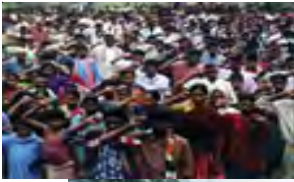
Saluting martyrs; land seizure

building the magic weapons of revolution building the magic weapons of revolution building the magic weapons of revolution building the magic weapons of revolution building the magic weapons of revolution building the magic weapons of revolution