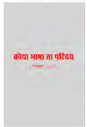
texts prepared by EDC