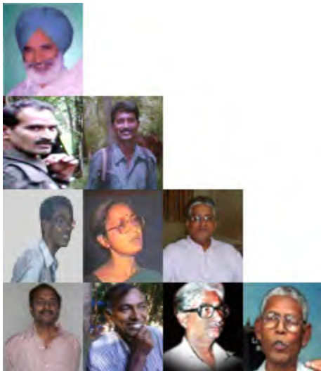
Polit Bureau and Central Committee members of the CPI (Maoist) who were martyred during the past decade.

Yes, we have striven hard to fulfil the promise given to you and made advances. It is so, because we are communists. Our words are sealed in deeds, serving the people. Inheriting the finest traditions of the