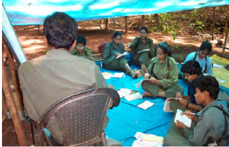
a MAS class

The SCOPE (Sub-Committee on Political Education) was formed by the erstwhile CPI (ML) (PW) in 1996-1997. SCOPE was damaged in 2003 and revived in 2008 after the 9 th Congress. Regional School was formed as part of it in 2009. But SCOPE has again been disrupted due to losses. Political education is carried out in all the States and Special Zones. But systematic structures for political and basic education have mainly been built and sustained in Dandakaranya (DK). Since most of the leadership forces at the Division level are from the adivasi community and they became literate only after joining the party, it is very much necessary to pay special attention to give them ideological training. Formed in April 2009 by the Central Regional Bureau the Regional Political School (RePoS) was given the responsibility of teaching MLM theory and discussing the problems in applying them for developing the Division and Special Zone (State) level leadership forces. Classes are mainly conducted in Koya language (the main adivasi language in DK), and in Telugu too. In the first round, fundamental theoretical aspects of Marxist Philosophy, Political Economy, Indian Economy, MLM tactics and the Party's Experiences are taught.