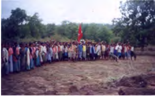
Peasants seizing land in Jharkhand

In contrast to this, after the Indian exploitative classes became heir to the political power of the outgoing colonial rulers in 1947, they and the imperialists have concentrated more and more land in their hands by using state power. In the wake of the growing democratic consciousness of the people of India, acquired in the course of anti-colonial struggle, it was no longer possible to rule the old way. The old form of direct colonial rule, control and exploitation gave way to a neo-colonial form of indirect rule, control and exploitation. Nor could private property be maintained in the old form. Princely states, kings, zamindars, landlords of the old type, all of them were becoming obsolete and therefore had to give way. Abolition of Zamindari Act, Land Ceiling Act, etc. were promulgated. More than six hundred states and all zamindari estates, the colonial legacy of the hated Permanent Settlement, were formally abolished. Farcical ruling