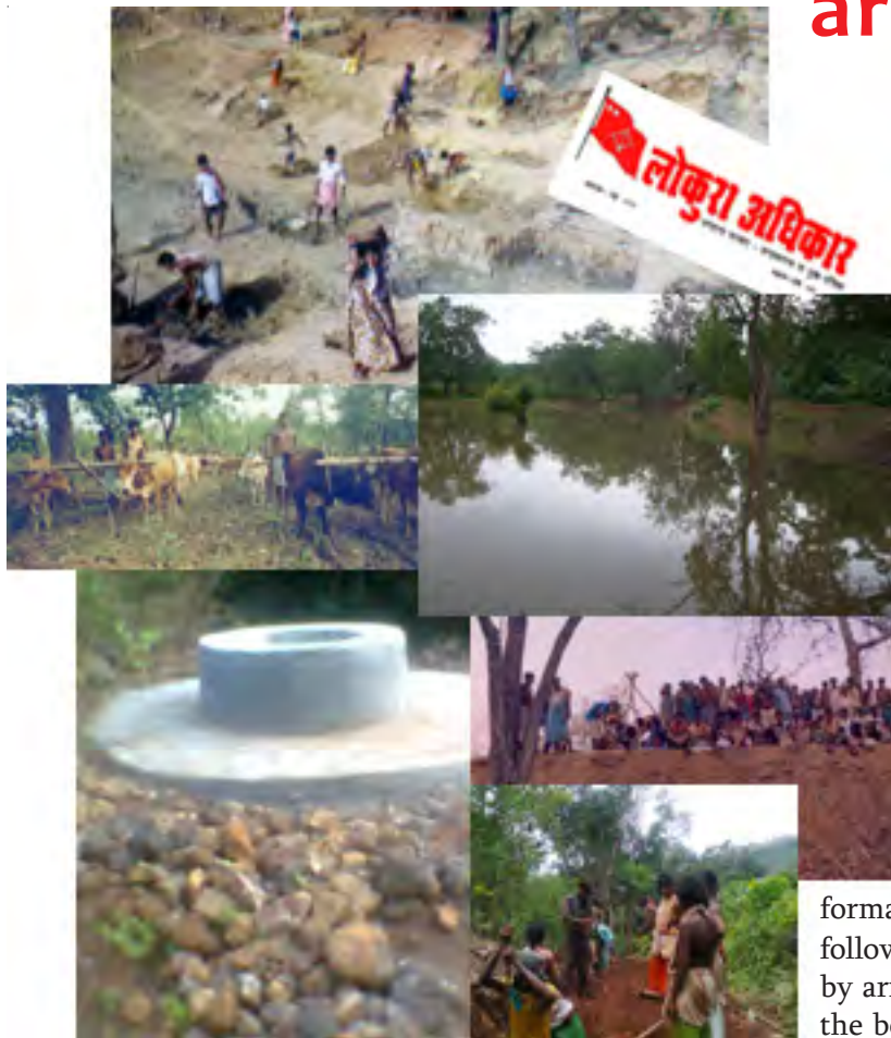
Land clearing by KKC in B-J; KJS journal; pond and dam built with collective labour in DK; land clearing and well in Niyamgiri (Odisha); plough agriculture in DK.

the process of further development, these KKC are being transformed into RPCs at various levels. RPCs have also been formed in the Andhra-Odisha Border (AOB) region, known here as Viplava Praja Committee.