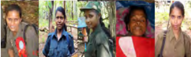
Some outstanding women martyrs.

In the darkness of no moon In the light of full moon In the deep forest I am alone, I put my foot forward, I take a step backward Wherever I step it is dark, brother Their only daughter, this bright beauty, This beautiful face they have ruined, brother They have forcibly married me off, brother ..... Yes, brother yes, I have heard your view I will no longer stay in this darkness I will go forward towards a red dawn