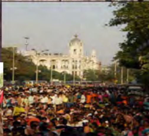
(clockwise from top) PLGA training; rally at Kolkatta in support of Largarh; weapons seized in Nayagarh raid; weapons seized at Manpur; militia training; PLGA parade; saluting martyrs; Greyhounds annihilated in Balimala ambush; rally at Largarh; rally at Narayanpatna; 'Boycott Election' campaign poster in a guerilla zone; PLGA training.