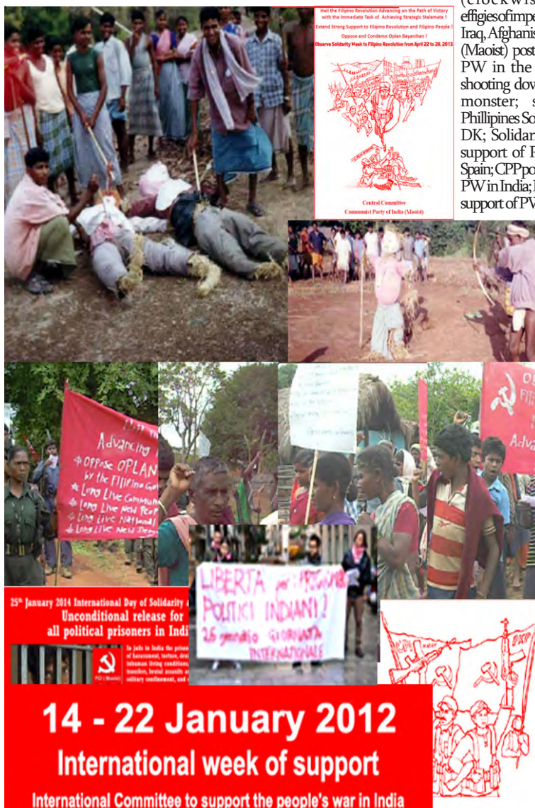
(clockwise) Burning effigies of imperialism against Iraq, Afghanistan wars, CPI (Maoist) poster supporting PW in the Philippines; shooting down imperialist monster; scenes from Philippines Solidarity day in DK; Solidarity action in support of PW in India, Spain; CPP posters supporting PW in India; Propaganda in support of PW in India.

The CPI (Maoist) has always educated its ranks and the masses it leads in this spirit of proletarian internationalism. It has been active in the international Maoist movement through various means. It was one of the initiators of the Co-ordination Committee of Maoist Parties and Organisations of South Asia. It has participated in issuing joint statements with other Maoist parties, the ‘Declaration on Anti-revisionist Struggle’ in 2008 and recently the Joint May Day Statement of this year. It took up the defence of MLM against the Prachanda-Bhattarai revisionism and Avakianist liquidationism. The