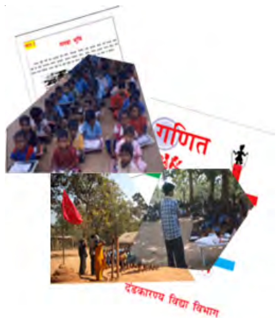
Science textbook prepared by DK Educational Department; primary class in a village; maths textbook; school scenes. (clockwise, from top)

Schools are established under the Janatana Sarkars. The subjects are language, mathematics and science. They are taught in Koya, the mother tongue of the students. Hindi is taught from 3rd standard and English from 5th. Teachers working in these schools are given training on teaching methods, student psychology and scientific education. The topics are explained to the students in their concrete conditions and experiences. Dignity of labour, collective spirit, serving the people and such socialist values are being imbibed. Vegetables and paddy are harvested near the schools to fulfil the food needs of the teachers and students. Efforts are also put to teach handicrafts to the students. Preserving the positive aspects in adivasi culture, including its collective spirit and dignity of labour, scientific knowledge is imparted to drive away superstitions entrenched in society. Earlier there were 9 residential schools, apart from those in villages. They have now been forced to become mobile and change locations frequently to avoid enemy attacks. The enemy specifically targets Janatana Sarkar run schools and its teachers. Teachers and students attending schools always keep bows and arrows ready for self-defence and do regular sentry duty.