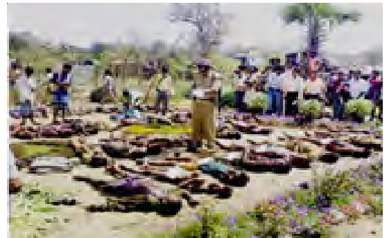
Enemy casualties at Ranibodli

The enemy forces started to enter Minpa area with all preparations on 15 May. PLGA forces started retaliatory actions on them immediately. Due to these attacks one thousand enemy troops had to stop and set up camp at Mina village temporarily.