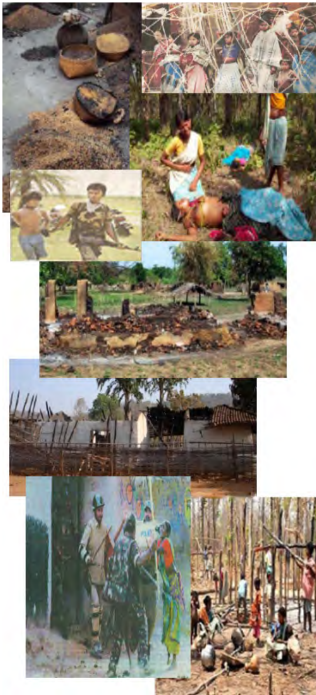
Adivasis forcibly held In a Salwa Judum camp; murdered adivasi woman; houses destroyed by the Judum; police atrocities; destroyed grain. (clockwise from top)

1 February 2007. A people's festival took place in the Indravati area of Maad division in the Dandakaranya Special Guerilla Zone. The government launched Salwa Judum to swallow the people and the party leading them. They did not allow the people to cut the crops. They did not allow them to bring the crop home. They did not allow them to stay in their homes. They did not give them a chance to celebrate the Gaade Pandum (Gaade festival) after bringing home the new crop. What shall we do? Should we continue to suffer? No. Not at all. The forest belongs to us. This is our life. This is our war, the people's war. Let us make war, thought the masses. Tilling the land was a war. Protecting the forest was a war. Harvesting was done under the sentry of the militias. Thus the people stored the crop. Then they went to stay in another place. They thought this too was a part of the war. Now a loud message must be given to the enemy - We are not suppressed. We have war tactics. Beware! So the Janathana Sarkar (People's Government) decided to celebrate the people's festival. It conducted the Gaade Pandum on a larger scale.