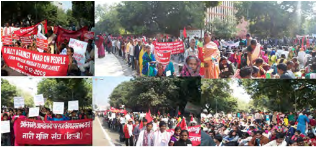
Scenes from a Delhi rally against the 'War on People'

The Indian state's 'War on People' has unleashed protest all over the country. Along with thousands of masses, a number of democrats too stood up courageously to challenge and expose the murderous deeds of the Central, State forces. This resistance indicated the potential for a radical polarisation.