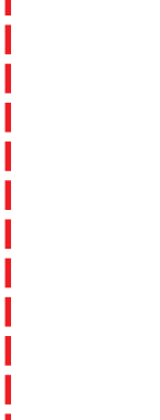
Com. Urmila (ACM)