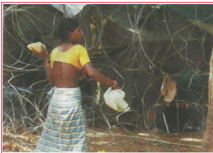
Edesmetta woman pelting stones on police and CRPF Camp

The next day another large contingent of CRPF visited the village and took away the seven dead bodies to Ganglur for post-mortem. The women of the village followed the policemen carrying the bodies of their fellow villagers all the way to Ganglur. The next morning on 19 May, the bodies were returned to their relatives after post-mortem. The women from the village placed the dead bodies in front of Ganglur police station and the adjacent CRPF camp in an expression of anger and protest against the perpetrators of the massacre.