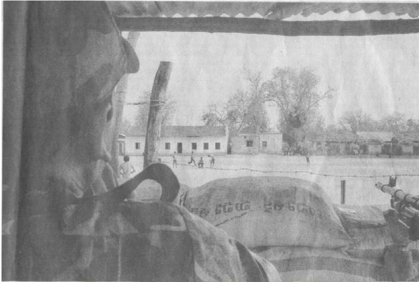
A CRPF sentry keeps watch as school children play outside a camp's barricades. In Chhattisgarh, the proximity of schools and security camps has blurred the line between civilian and military targets.

The facts related to the condition of the children in our country are bizarre, to say the least. A significant number of children in the remote rural areas are dying like flies due to extreme malnutrition and disease owing to lack of food and drinking water. The adivasi population, constituting over 8 crore that is equivalent to the population of Germany or the combined population of Canada, Australia, New Zealand and Argentina, has no access to safe drinking water. Worse still, instead of providing them with safe drinking water, the successive governments in