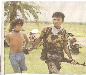
the solitary 'Maoist' taken alive in Salboni has been revealed to be a mentally-challenged mute-boy