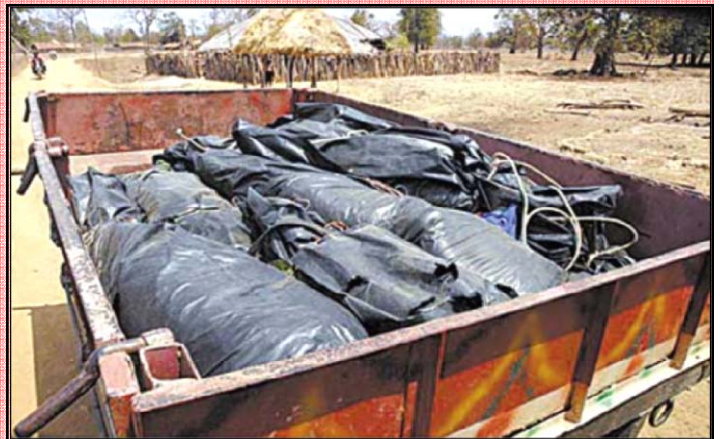
Not a scene from Pinochet's Chile but from YSR's police raj. Bodies of Pamedu martyrs were wrapped in plastic sheets and shifted to Konta government hospital for post-mortem. Bodies were deliberately allowed to putrefy to avoid identification by their families.

Virasam leader Varavara Rao has condemned the 'fake encounter' saying the government's efforts to suppress the revolutionary movement through such encounters will not succeed. Demanding that a case under section 302 of IPC be booked against the cops responsible for the encounter, he said it was a joint operation by the AP police and their Chhattisgarh counterparts with the Centre chipping in. The Virasam leader said the latest encounter came when the AP High Court has reserved its judgment on whether or not to book cases of culpable homicide against the policemen involved in encounters. Balladeer Gadar said it was inhuman as police killed those who were in deep sleep. TRS leader and former Union Minister K Chandra Sekhara Rao termed the incident as a fake encounter and demanded an enquiry by a sitting Judge of High Court. He condemned the YSR government for having broken off the talks with Maoists and creating indiscriminate bloodshed. The leaders of CPI, and the two tribal organizations, Nagara Bheri and Tudum Debba , condemned the incident as a fake encounter and condemned the various opposition parties for their silence over the ghastly incident. They said that political leaders will not be allowed into the tribal hamlets if they continued with such anti-tribal attitude.