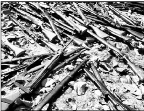
Old rifles and ammunition abandoned by retreating guerillas.

The immensely successful Nayagarh multiple raids demonstrate how a weak people’s army can achieve tactical victories over a numerically superior enemy by strictly following the principles of guerrilla warfare as enunciated by comrade Mao. This is proved by a series of tactical victories in the recent past such as Koraput, Giridih, R Udayagiri, Ranibodili, etc. All these successful tactical counteroffensives by the Maoist guerrillas effectively refute the theories of skeptics that revolutionaries cannot make headway faced with the mighty Indian state with its modernised army and paramilitary having superior training and weaponry.