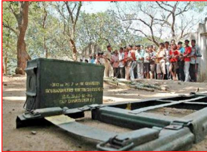
People taking a look at the ammunition boxes at the district armoury and Police Training School, at Nayagarh

the continuous Goebbellian propaganda by spokespersons of the ruling classes and police top brass