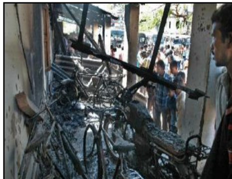
Gutted remains of Nayagarh armoury

classes. It took over three hours for the guerrillas to complete the operations and they retreated without suffering a single casualty. The stop parties of PLGA ensured that reinforcements of the enemy forces did not come to the rescue of the policemen. Six policemen were killed at a police reserve which houses the district armoury, four at the police training school, and two at the Nayagarh police station in the heart of the town. Two more policemen were killed when the guerrillas attacked another police outpost and two police stations on their way back. While retreating