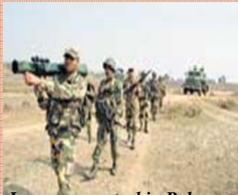
Jawans on patrol in Palamau district on Bandh day on February 21

According to media reports the bandh districts of Singhbhum-Kolhan and evoked. The shops and establishment remained closed. The police offering effective security. Even the post offices and other Government under-areas of West Singhbhum, East Singhbhum transportation of iron ores from mining parts of country were badly affected. At the Dhanbad division of East Central Rail- than Rs 4 crore as no loading of coal hap- preferred to remain off the National High- diverted for the safety of passengers un- Eastern Railway (SER) but many passengers did not prefer to travel in the local trains. There was deserted look at Ranchi railway station, bus-stands including private.