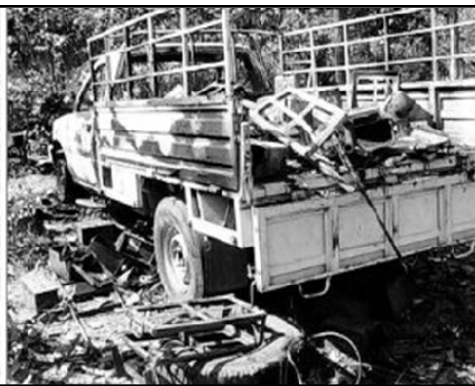
A vehicle left behind

tion and arms, many of which the Maoists torched before abandoning them”, wrote a newspaper. Several