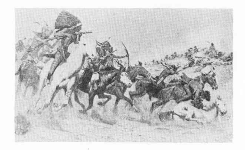
The combined armies of the Sioux and Cheyenne defeated Custer at the Little Big Horn, Montana on June 25, 1876.

In Latin America, the Monroe Doctrine became the signpost for U.S. monopoly capitalism's colonial expansion. In 1890, the U.S. imperialists organized the Pan-American Union, hastening the transformation of Latin America into the "back yard" of the United States. Theodore Roosevelt (president from 1901-1908) brandished his "big stick" to obtain sole rights to develop the Panama Canal; then, in 1908, he instigated a coup, resulting in Panama's secession from Colombia, and the U.S. occupation of the Panama Canal. In 1911 Taft (1909-1912), using dollar diplomacy, signed a loan agreement with Nicaragua and Honduras, seizing the rights to customs duties, railway and steamship transportation.