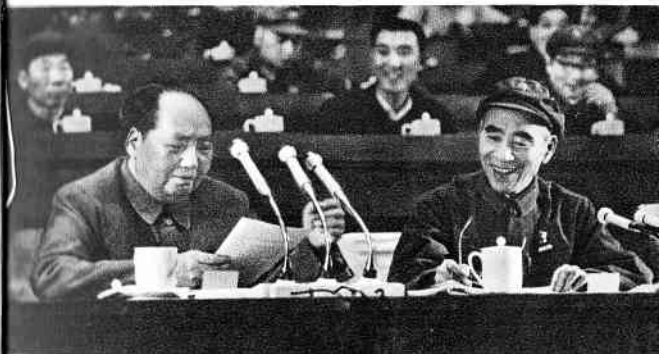
Our great leader Chairman Mao and his close comrade-in-arms Vice-Chairman Lin Biao on the rostrum.