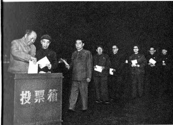
Our great leader Chairman Mao and his close comrade-in-arms Vice-Chairman Lin Piao, together with Comrade Chou En-lai and other comrades, voting in the election of the Ninth Central Committee of the Communist Party of China.