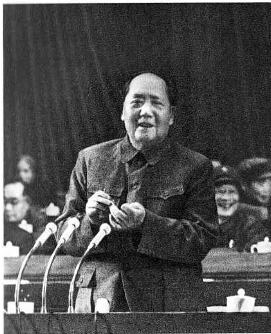
Our great leader Chairman Mao delivering a most important speech at the Ninth National Congress of the Communist Party of China.