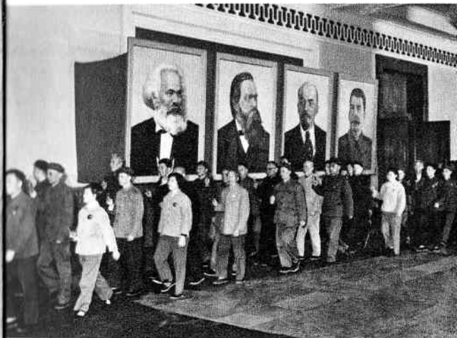
Delegates from various fighting posts march into the meeting hall full of revolutionary spirit.

Printed in the People's Republic of China