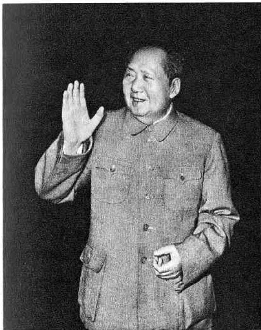
Our great leader Chairman Mao cordially greeting the delegates at the closing session of the congress.