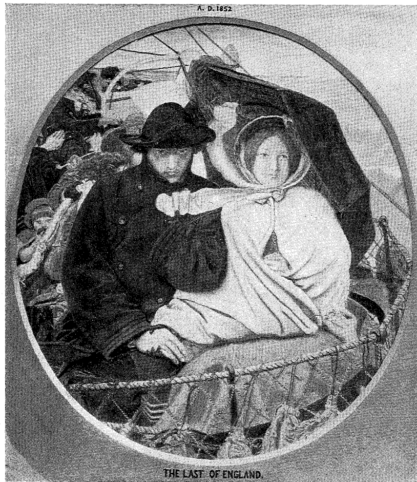
THE LAST OF ENGLAND. FORD MADOX BROWN