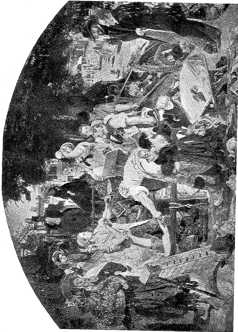
Work FORD MADOX BROWN