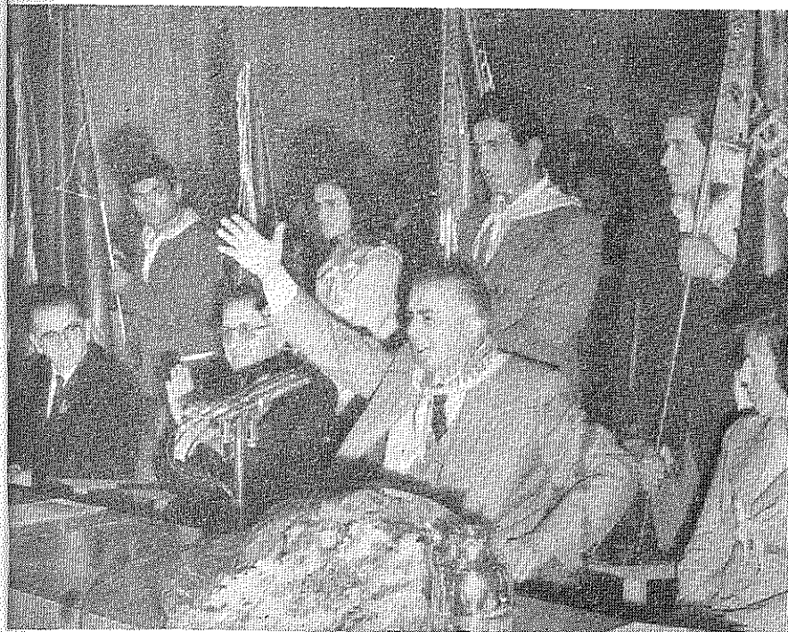
Comrade Enver Hoxha speaking at the closing session of the Congress

You young comrades, have a beautiful life ahead of you, because, both for this beautiful life which we have built and for that of the future, which will be even more beautiful, you have shed your blood, you will pour out sweat, you have given the strength of your youthful muscles, your creative thinking, you knowledge and the love of your fiery hearts. Here you spoke about only some of those great works which you have given the people. You were modest in what you said, but it is very good to be modest. I congratulate you, because your works are innumerable. The Party acknowledges them, the people acknowledge