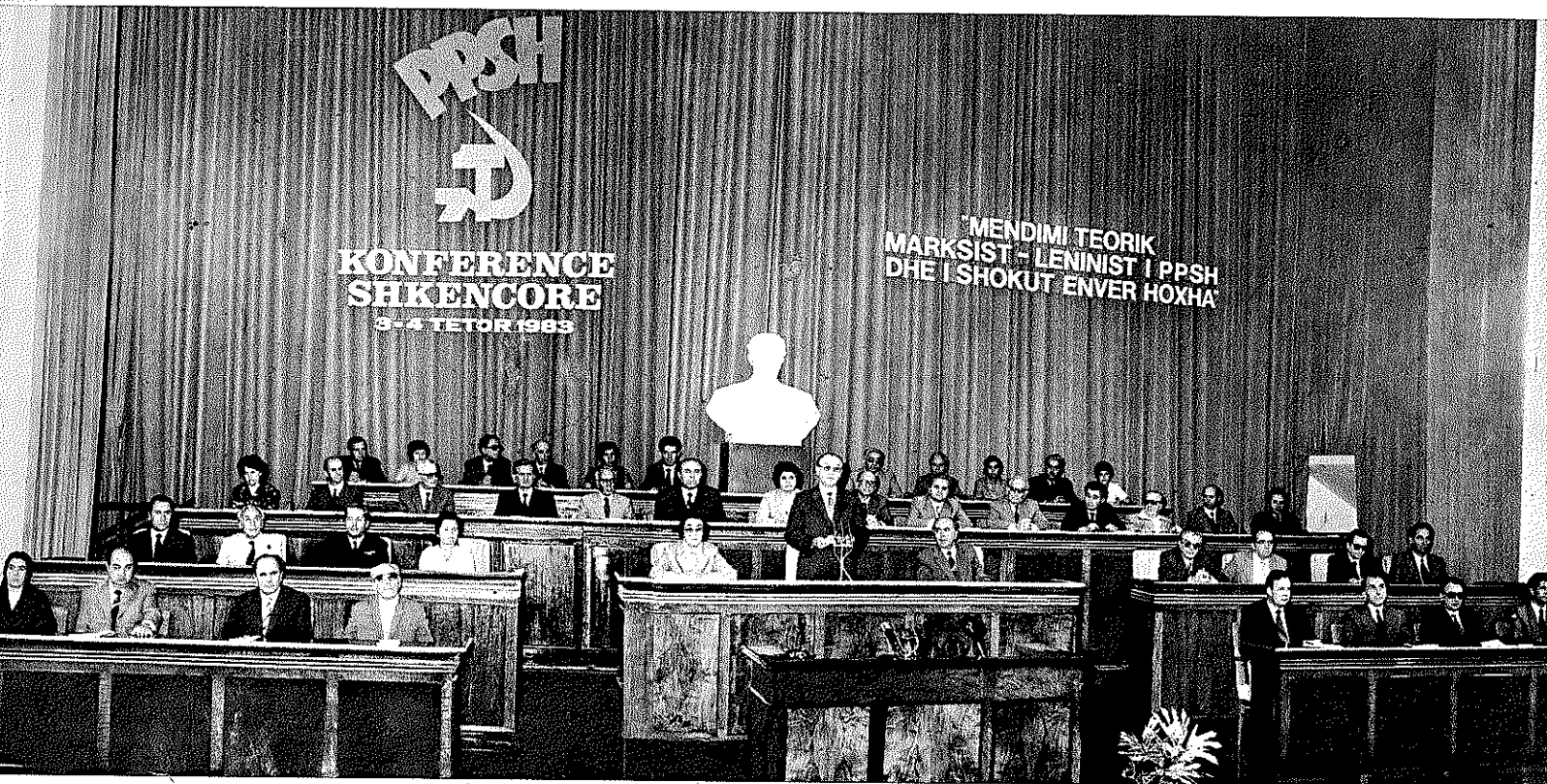
The presidium of the Conference