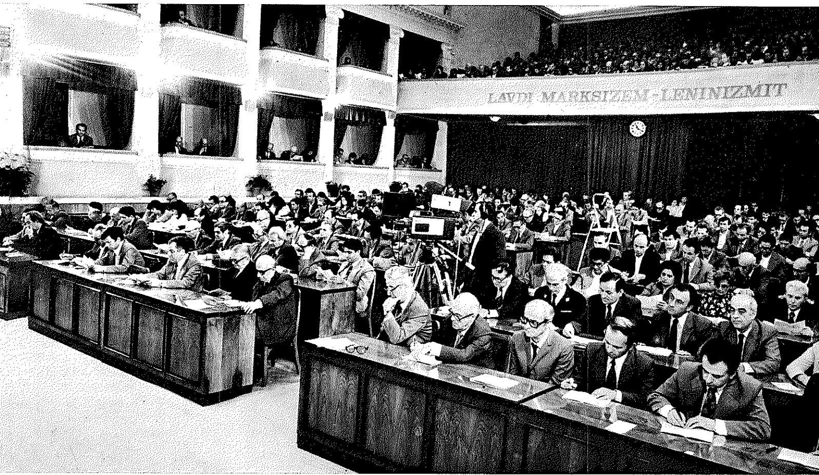
The hall in which the Conference held its proceedings