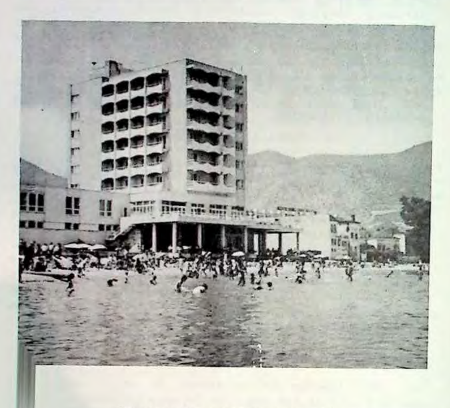
Hotel at Pogradec on Lake Oher

This is a very popular resort in summer, being much cooler than the coast. Enver Hoxha passed many holidays here. Trade unions run subsidissed holiday hotels here for their members, as they do throughout Albania. Children usually spend their summer holidays in Pioneer Camps, which are also heavily subsidised and are to be found along the coast and in the mountains.