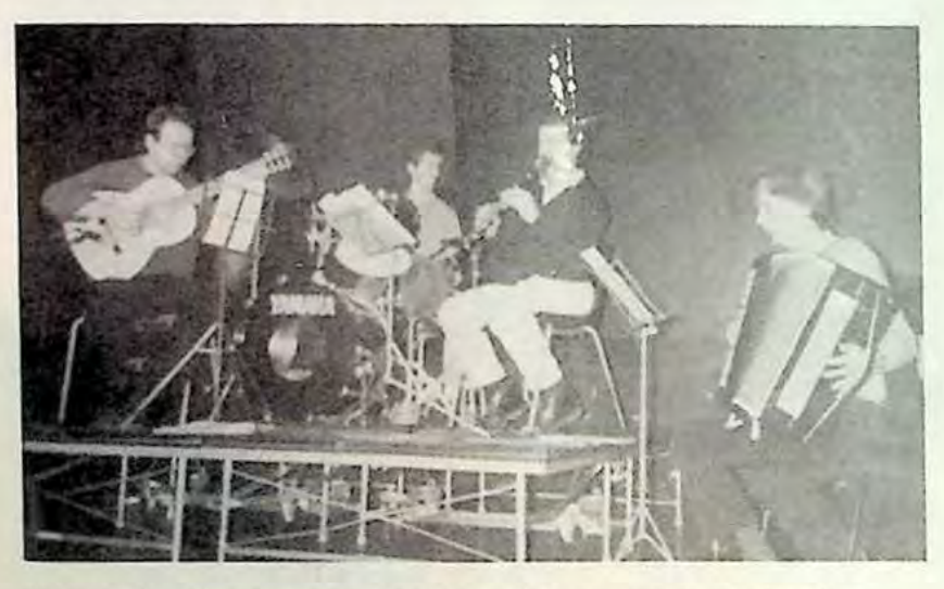
"Liria", playing at the November meeting in London

After hearing the evidence and the arguments for both sides, the audience was asked to function as a jury in the case. It decided without dissent that Britain had violated Albanian sovereignty on 22 October 1946 and on 12-13 November 1946, and that the evidence did not justify holding Albania responsible for the laying of the mines concerned in the case. The request was made for one abstention to be recorded.