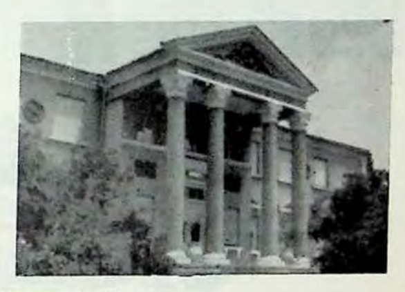
The Lenin-Stalin Museum in Tirana

The cost is £31.50 including postage, but 20% deduction is available if membership of the Albanian Society is quoted.