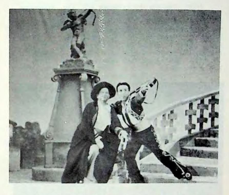
A performance of Rossini's "The Barber of Seville" by the Opera and Ballet Theatre

Prime Minister Adil Çarçani presented the programme of the new government, which was approved, as were the decrees issued by the Presidium since the last session of the Assembly.