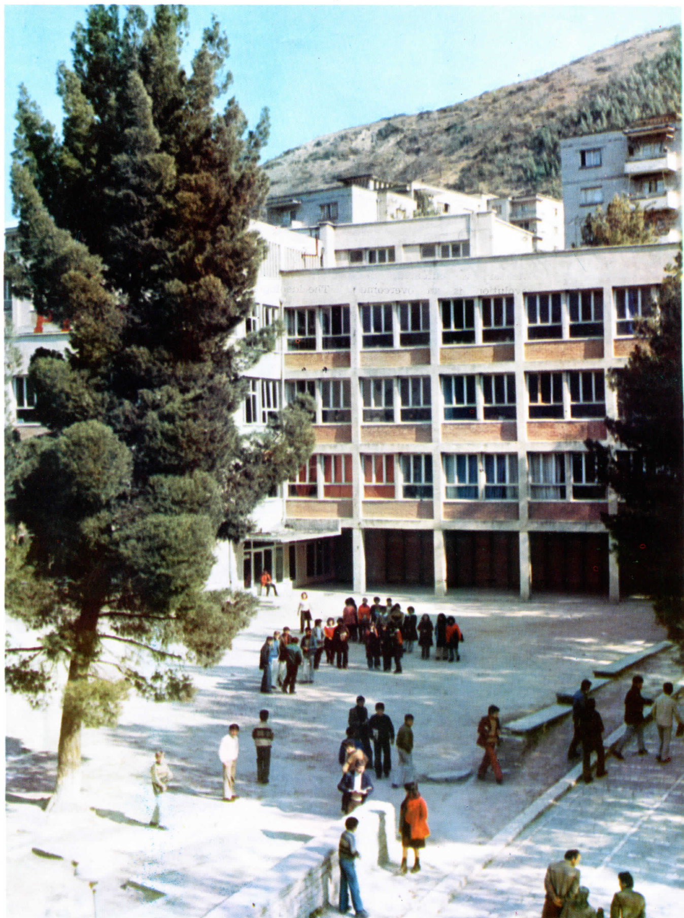
September 1st, the first day of school; a beautiful celebration of the entire people. In photo: View of a school in the mountainous district of Skrapar.