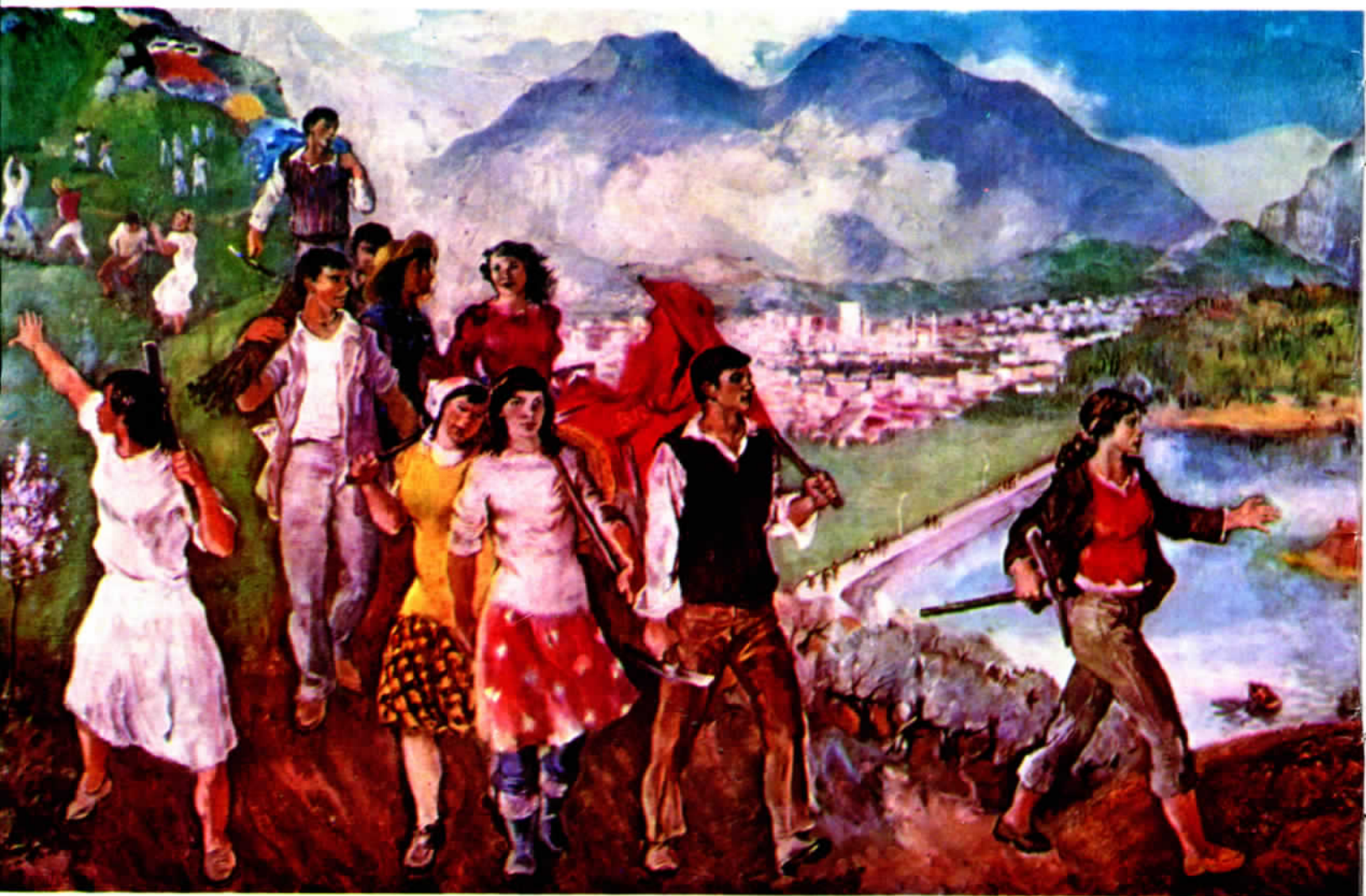
Participation in the major labour actions for the construction of the big projects of socialism is one of the most important features of the new man educated by the Party of Labour of Albania with the teachings of Marxism-Leninism. Every Albanian young man and woman considers it honour to do voluntary work in the projects of socialism. This painting represents the joy of the volunteers leaving for one of the many mass labour actions of the youth.