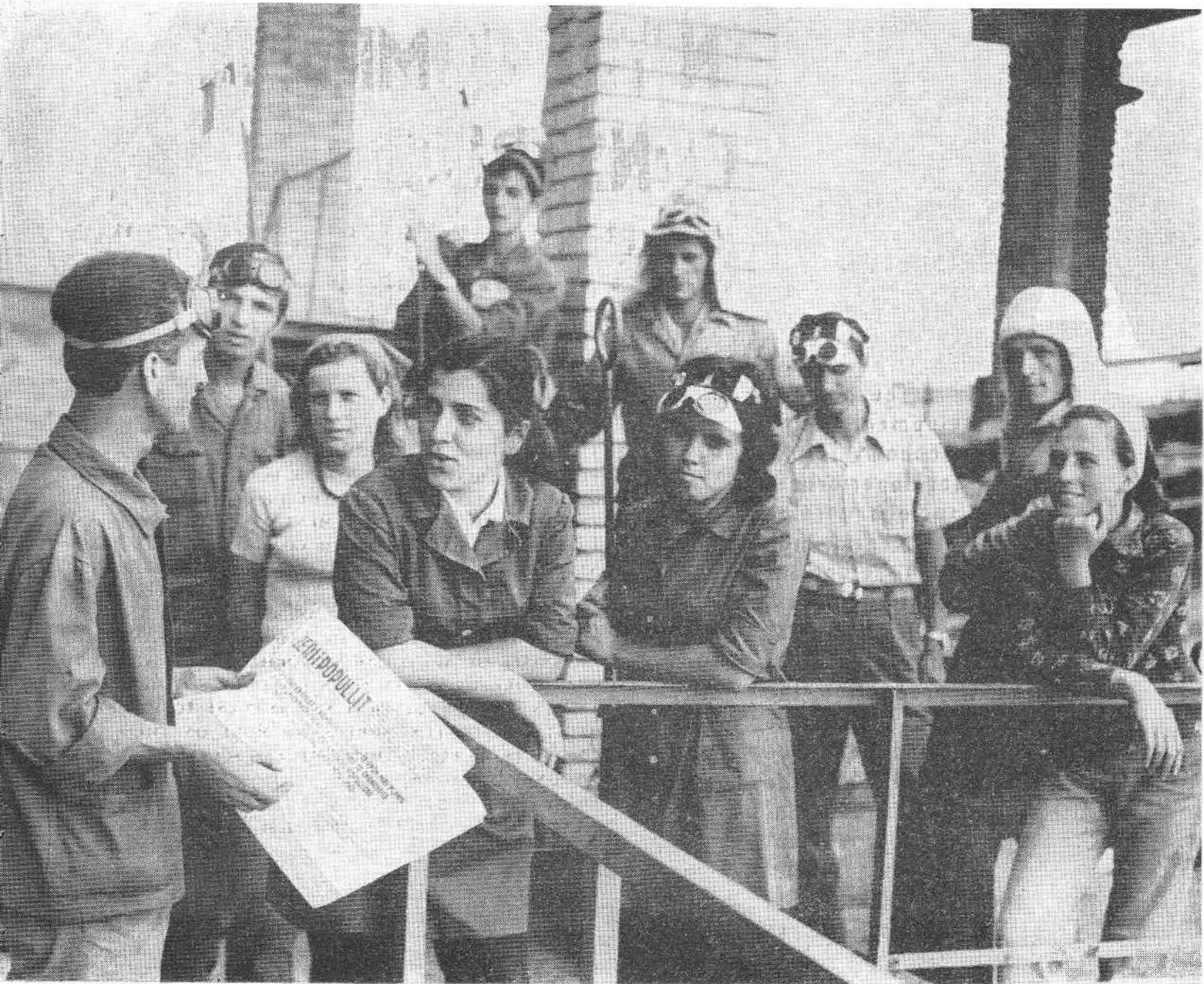
The Albania working people are extensively discussing the draft-directives of the five-year plan.