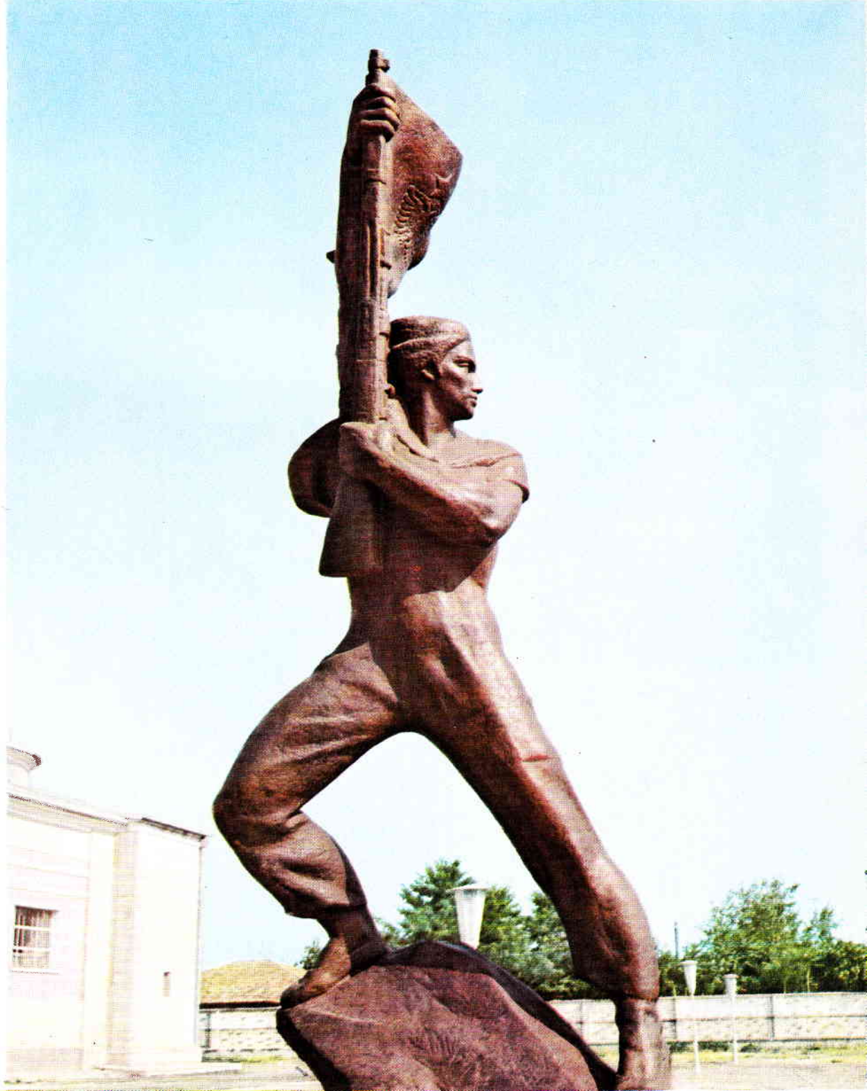
«KEEP HIGH THE REVOLUTIONARY SPIRIT», sculptur by Mumtas Dhrami