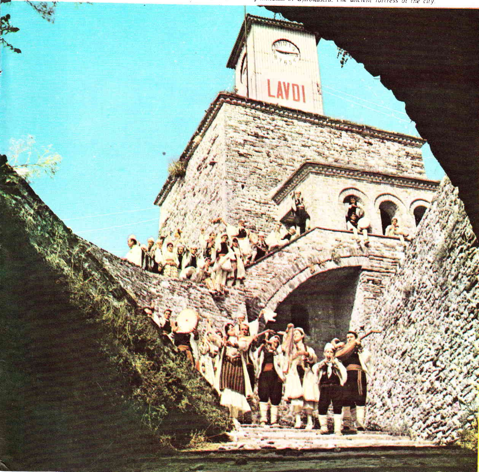
A view of the city-museum of Gjirokastra. The ancient fortress of the city.