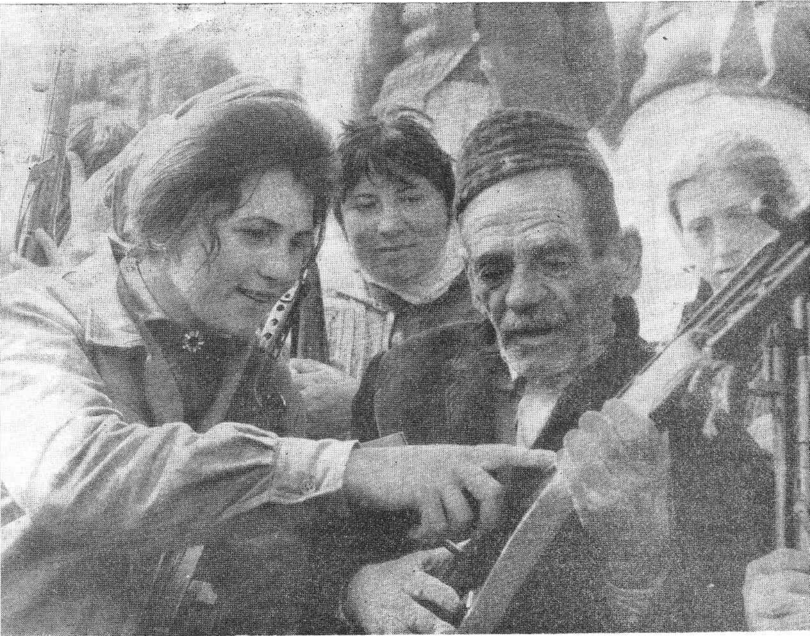
The gains of socialism with us are secure, for they are defended by the People's Army and the whole soldier people