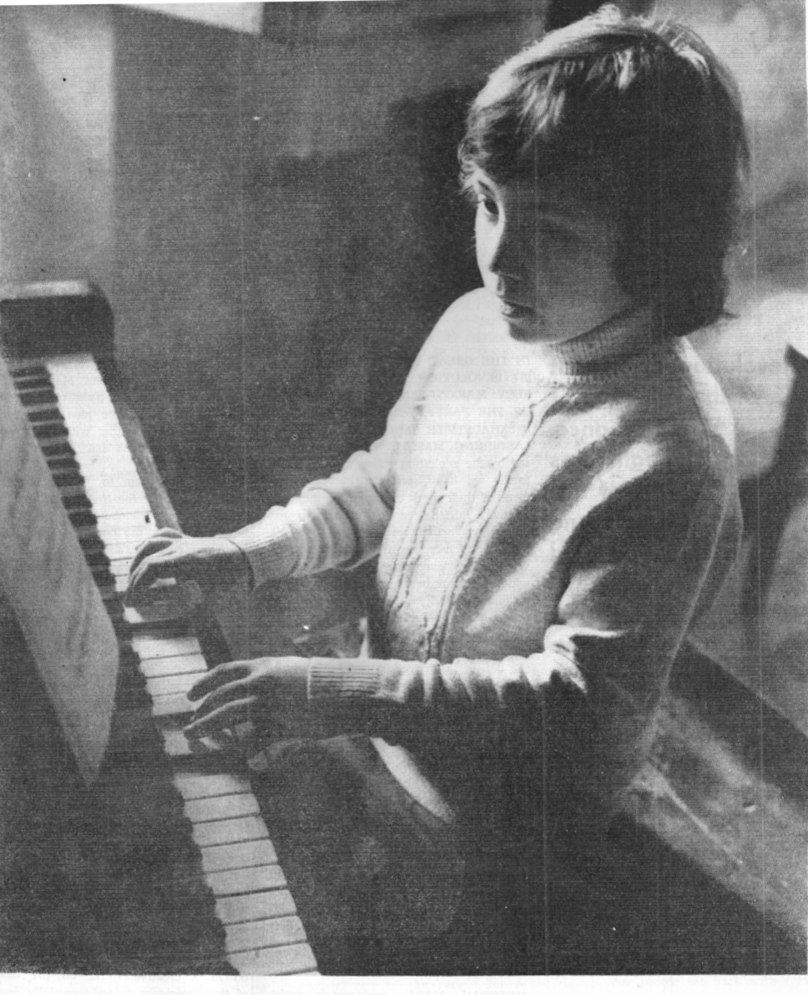
The artistic professional education in Albania begins from the young age. A would-be pianist doing exercises