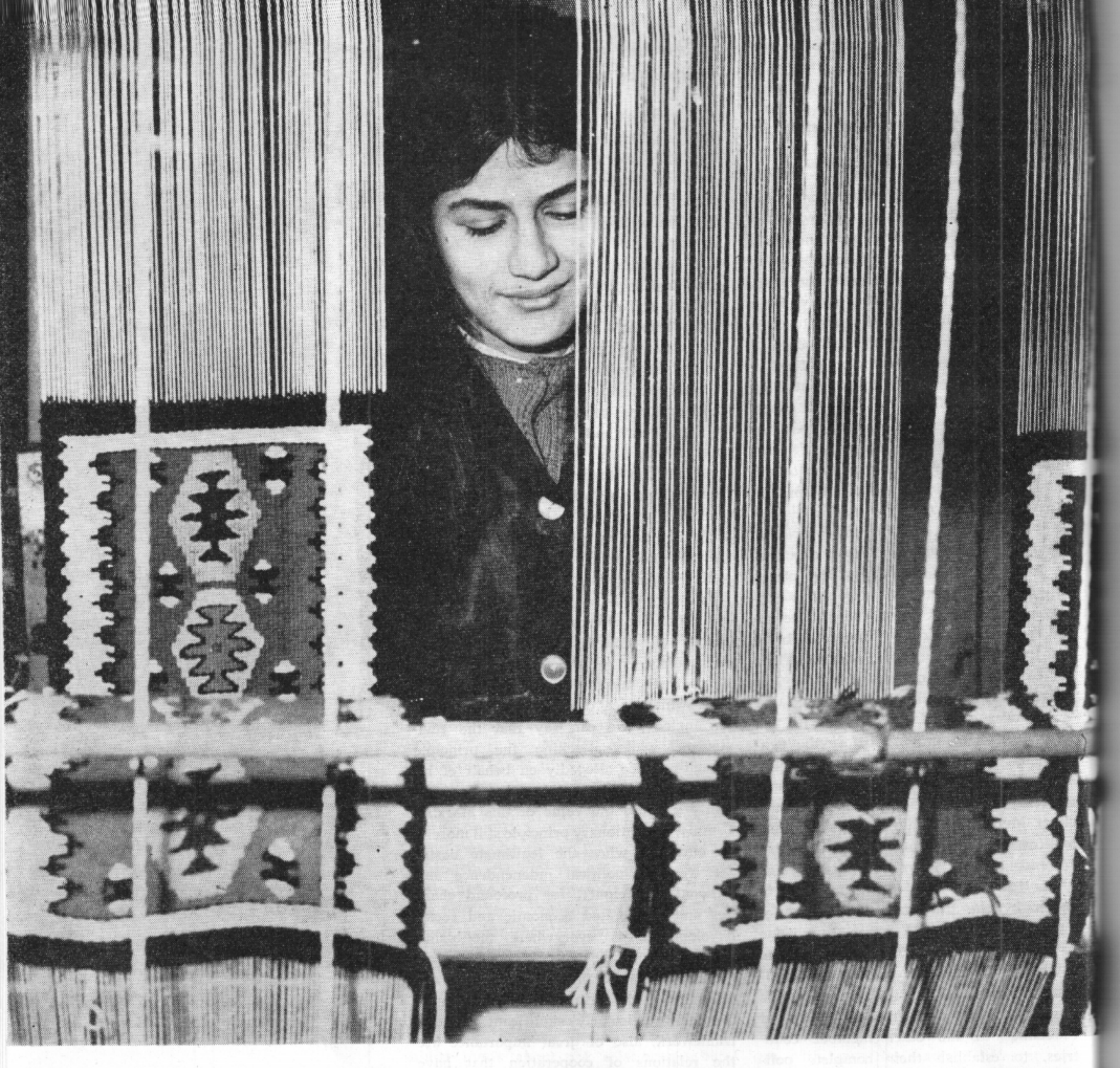
Artistic handicraft has traditions of long standing in Albania. The Albanian young women take forward the craft of carpet ma