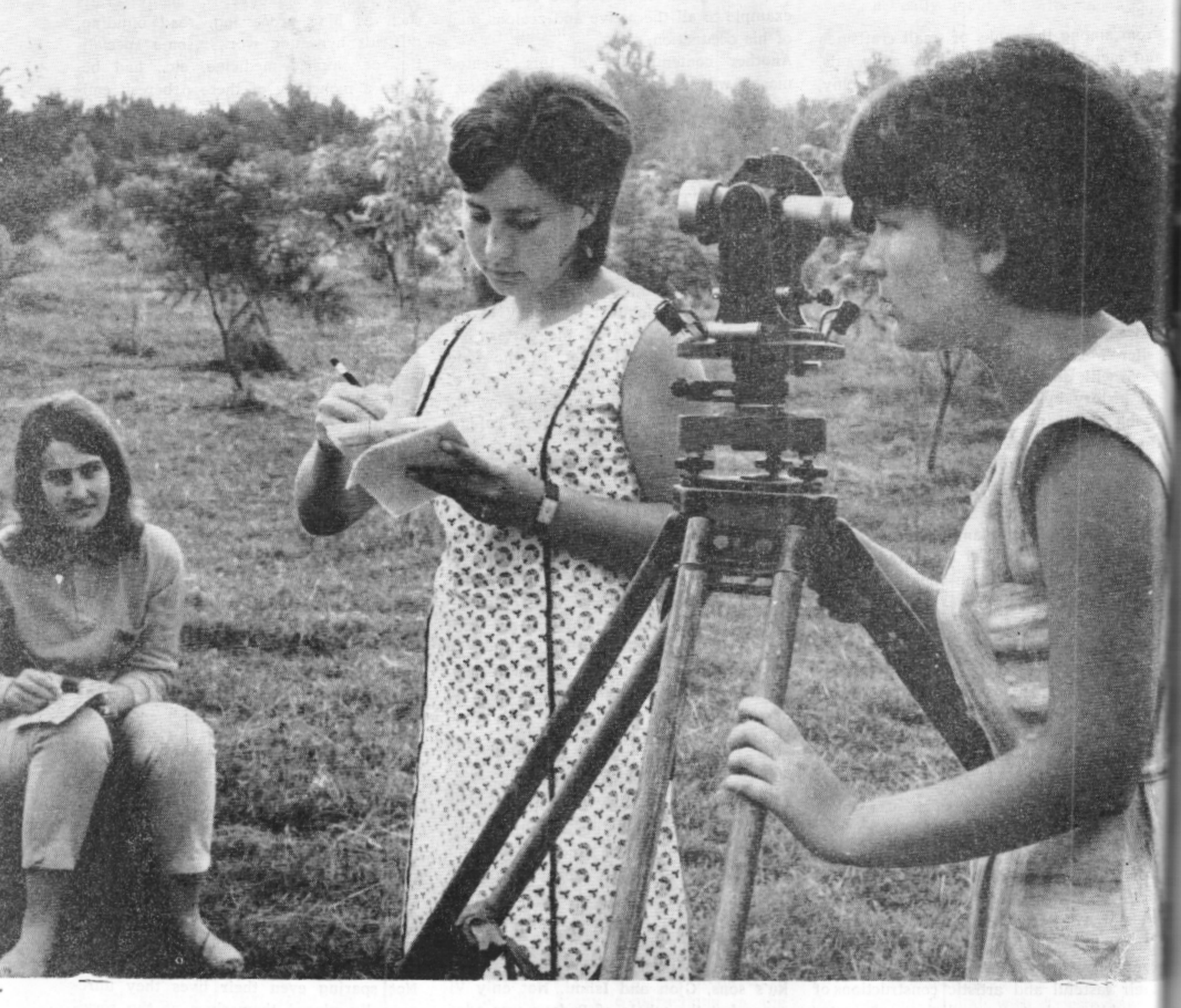
Students of the engineering faculty during their practice for the preparation of their diplomas