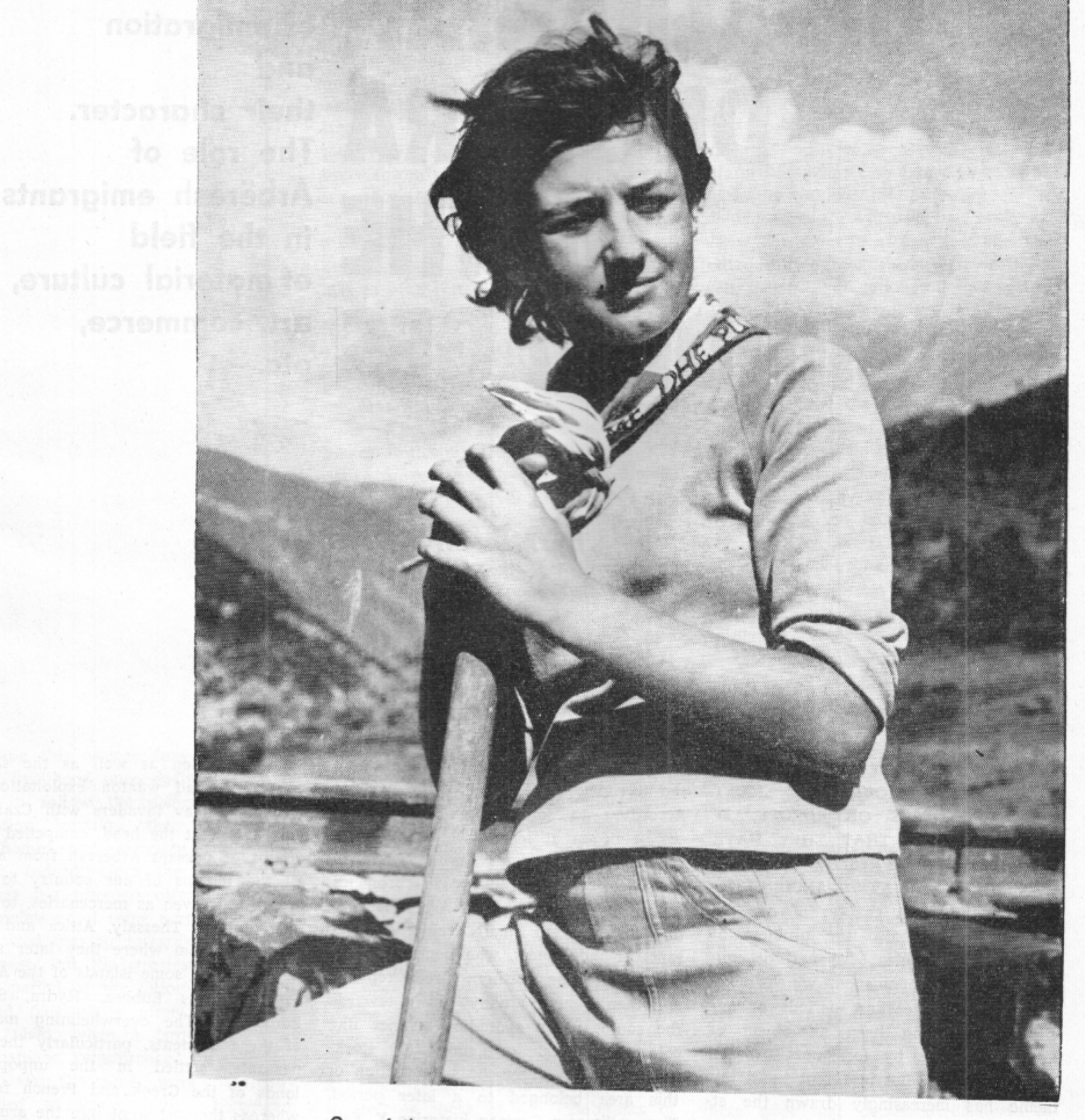
One of the young volunteers in the building of the new Elbasan-Prrenjas railway

All these and many other facts of day to day life speak of a radical turn being made step by step in the living standard and way of life of our people. We should not forget for a single moment that the whole of this development has been carried out in complicated circumstances and in struggle against numerous obstacles and difficulties, connected with the great economic and so-