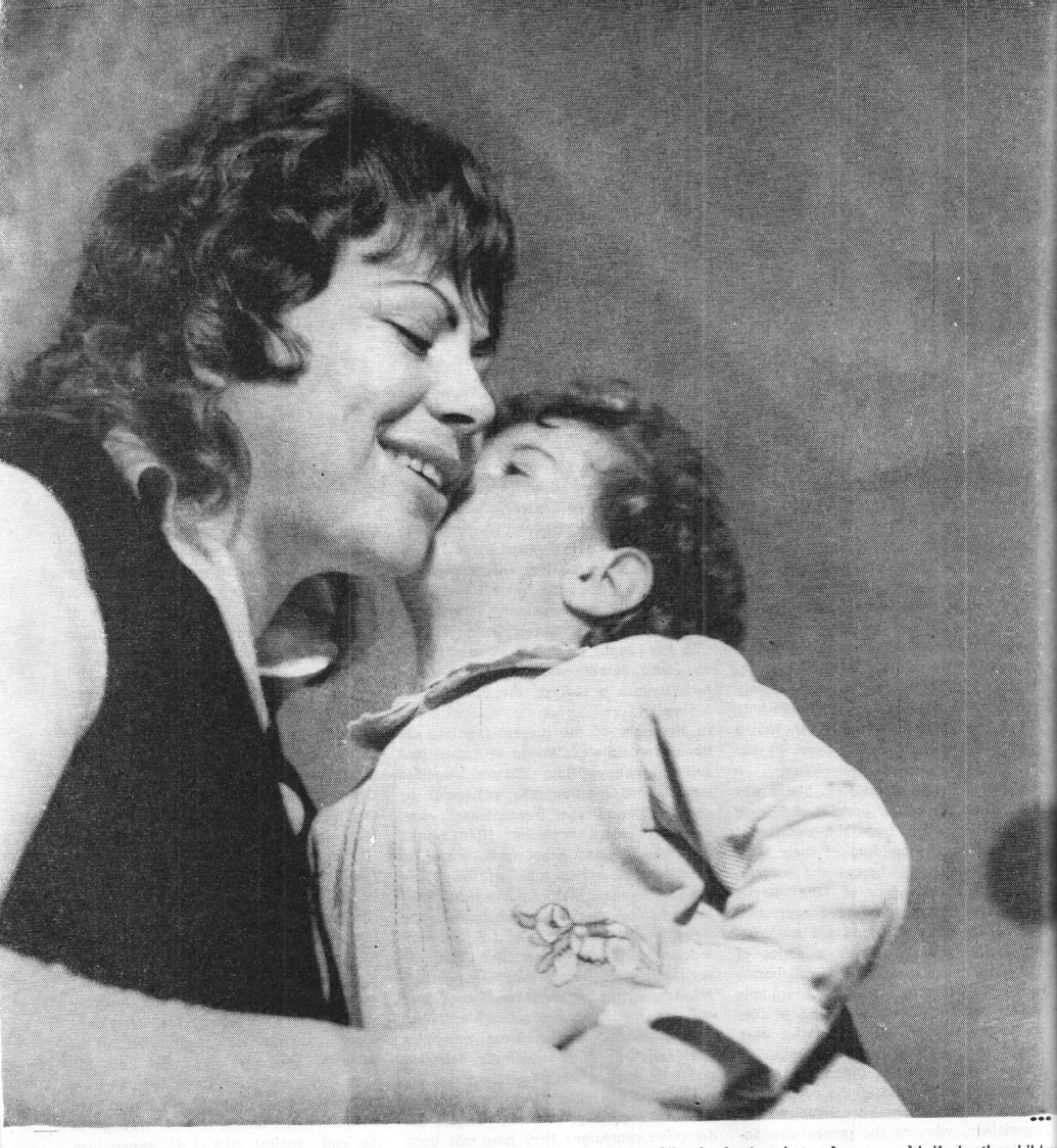
Medical assistance for mother and child is guaranteed by law in Albania. In the photo: A young midwife in the children consultation centre in Peshkopia